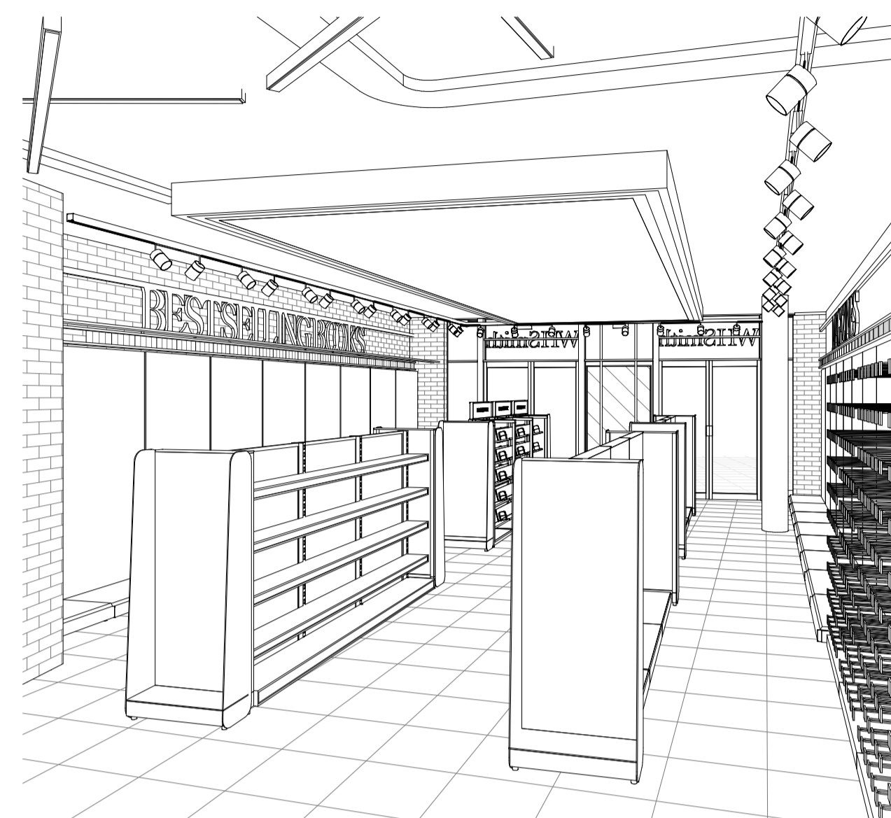
5 ISOMETRIC VIEW 1