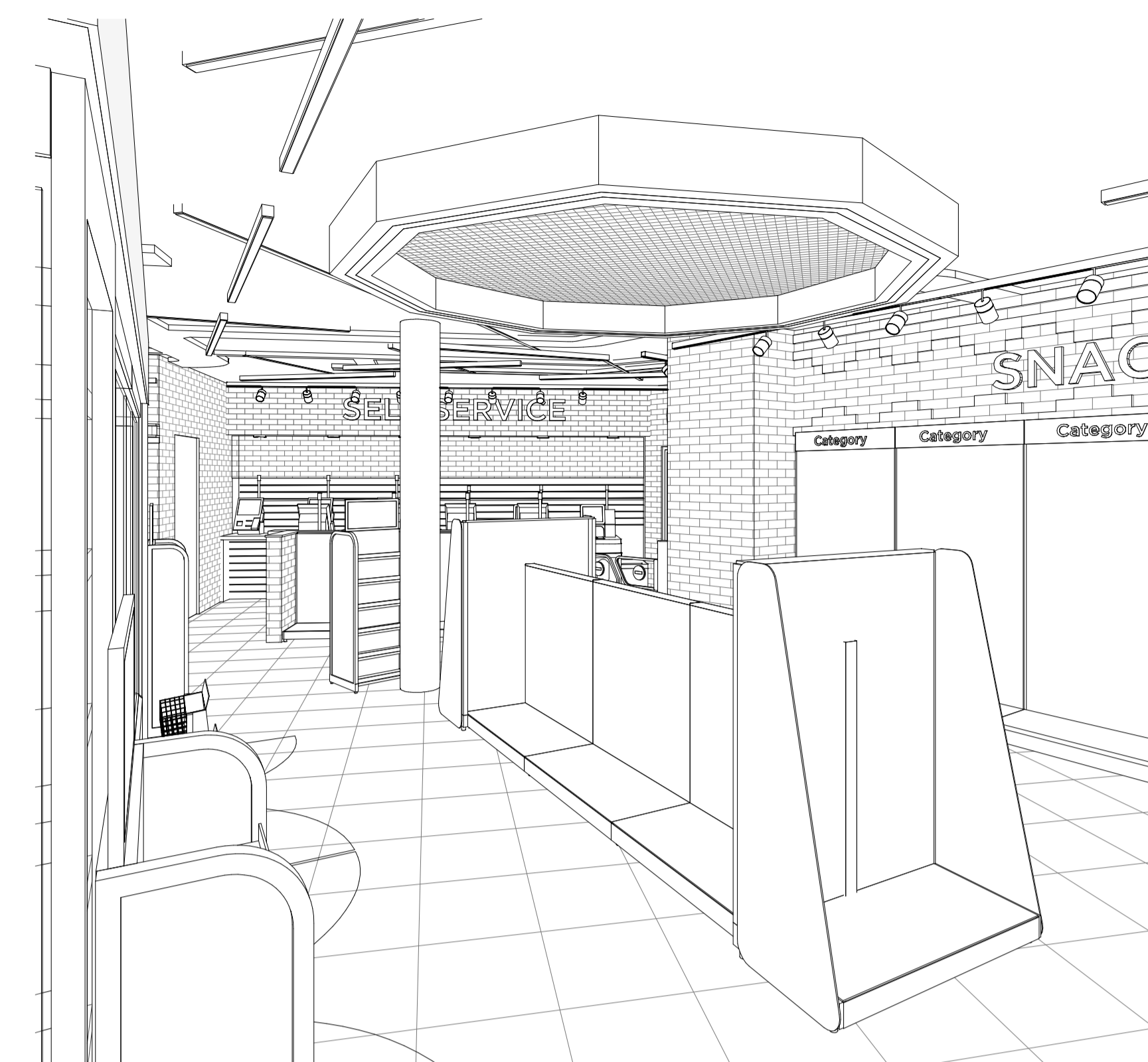
4 ISOMETRIC VIEW 2