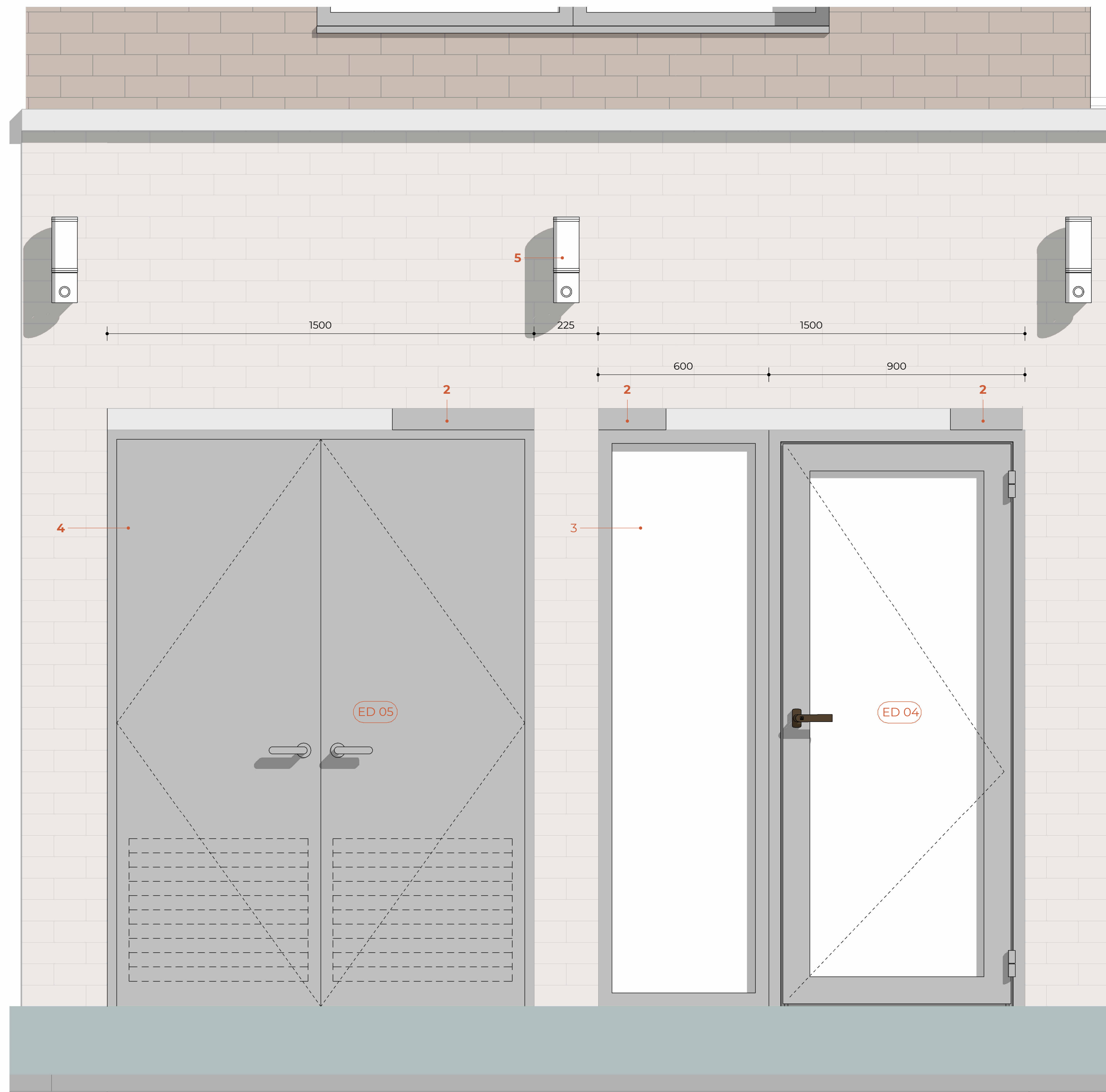
ED04+ED05 - Front Elevation