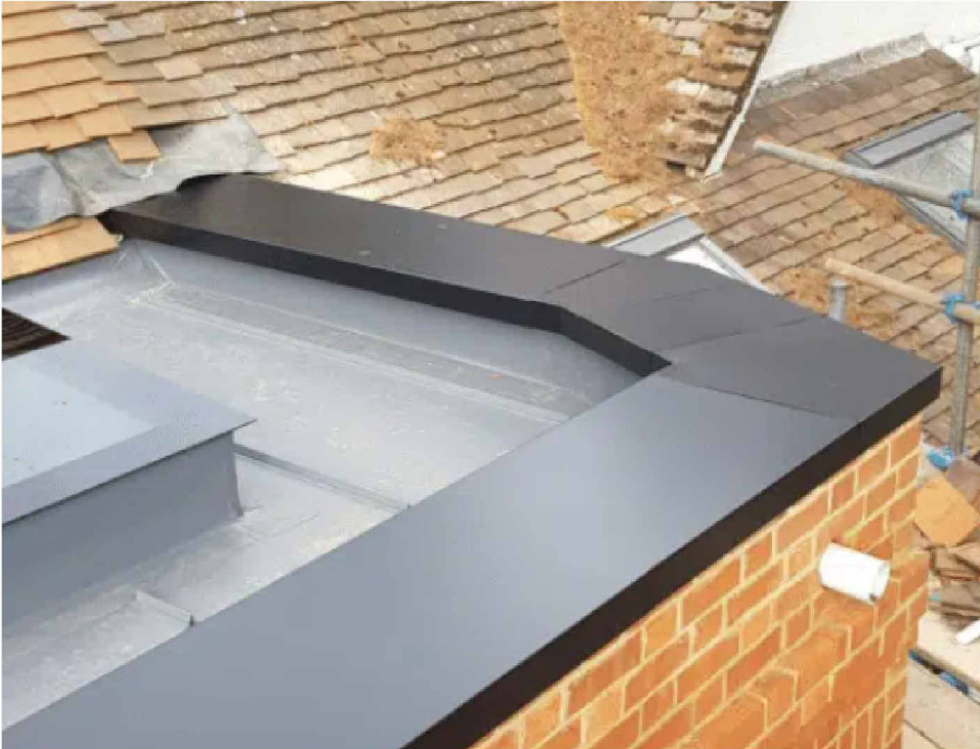
Powder coated aluminium coping 300 x 60 mm https://kladworx.com/products-and-services/aluminium-coping/