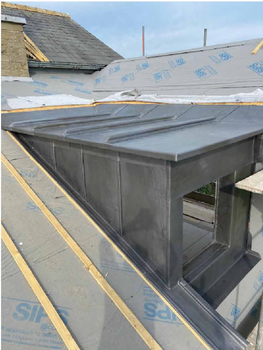
Lead Layer 3 mm thick https://theleadlads.co.uk/lead-dormers/