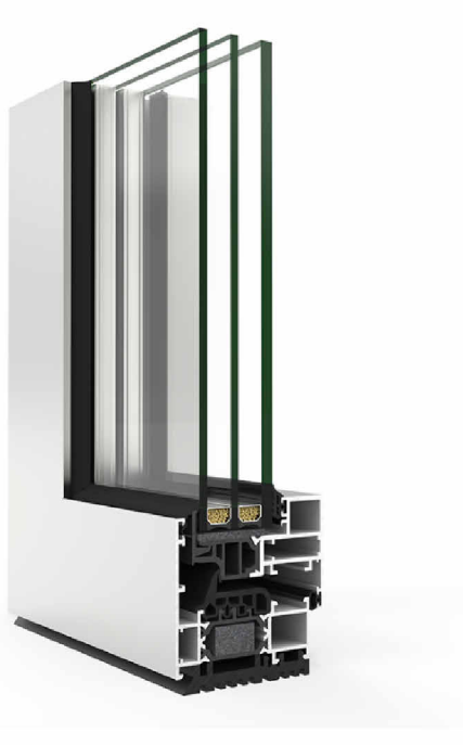
Powder coated aluminium windows Sizes as approved https://www.cortizo.com/en/sistemas/ver/79/cor-70-hidden-sash-tb.html