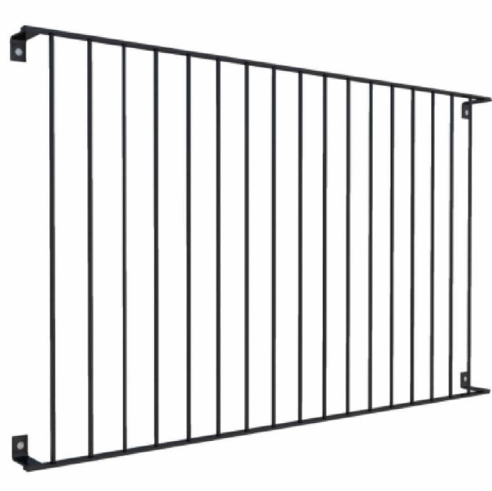
Juliet Balcony - anthracite grey finish 1925 x 1100 mm https://www.ironoctopus.co.uk/wharfedaleJuliet-Balcony.html