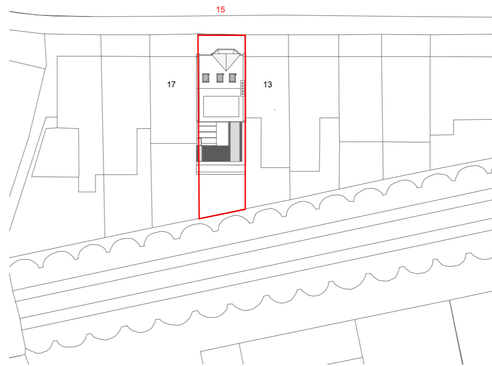
② Proposed Block Plan Scale 1:500 @ A3