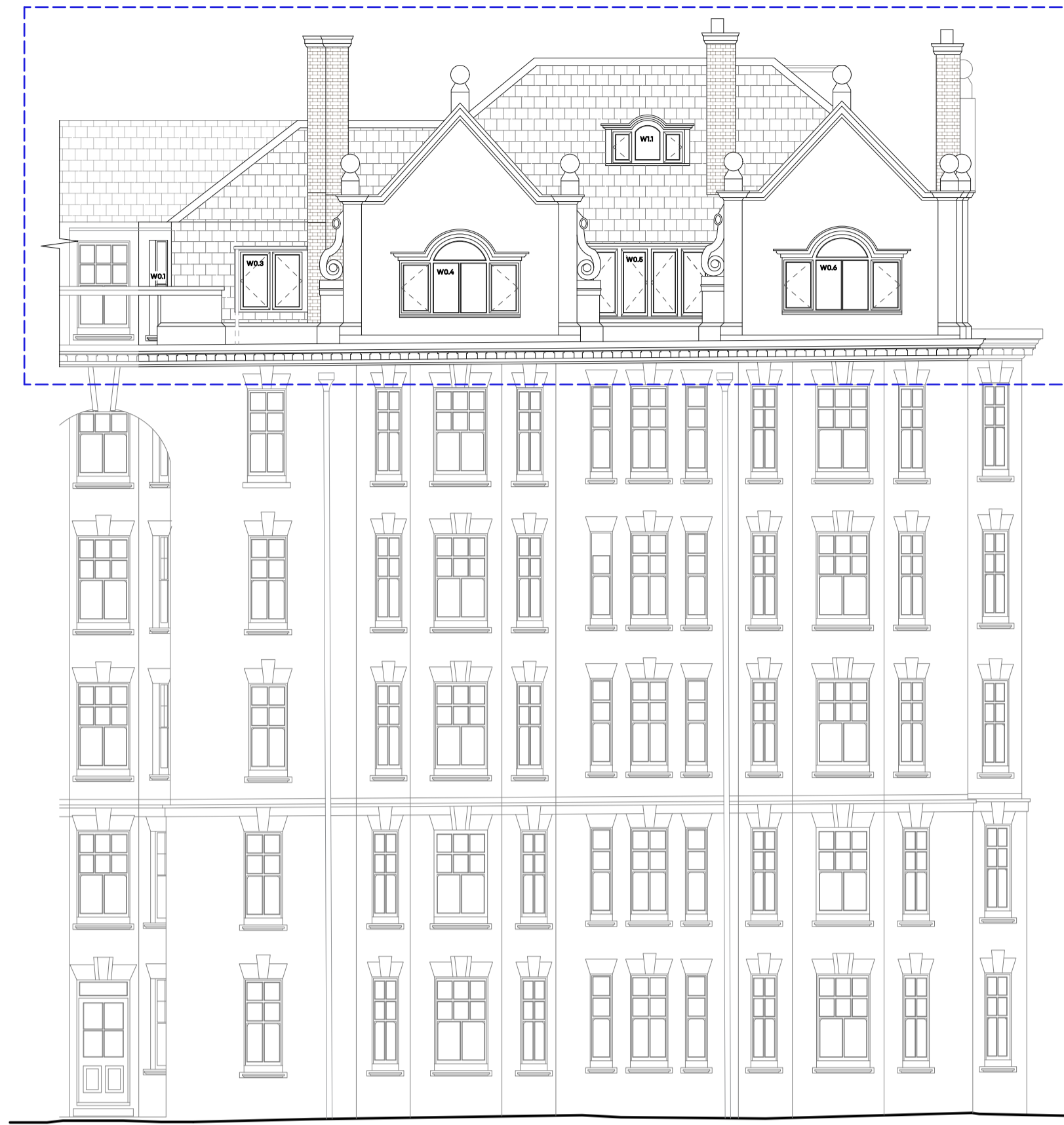
2 Existing North-East Elevation 1:100 @A1