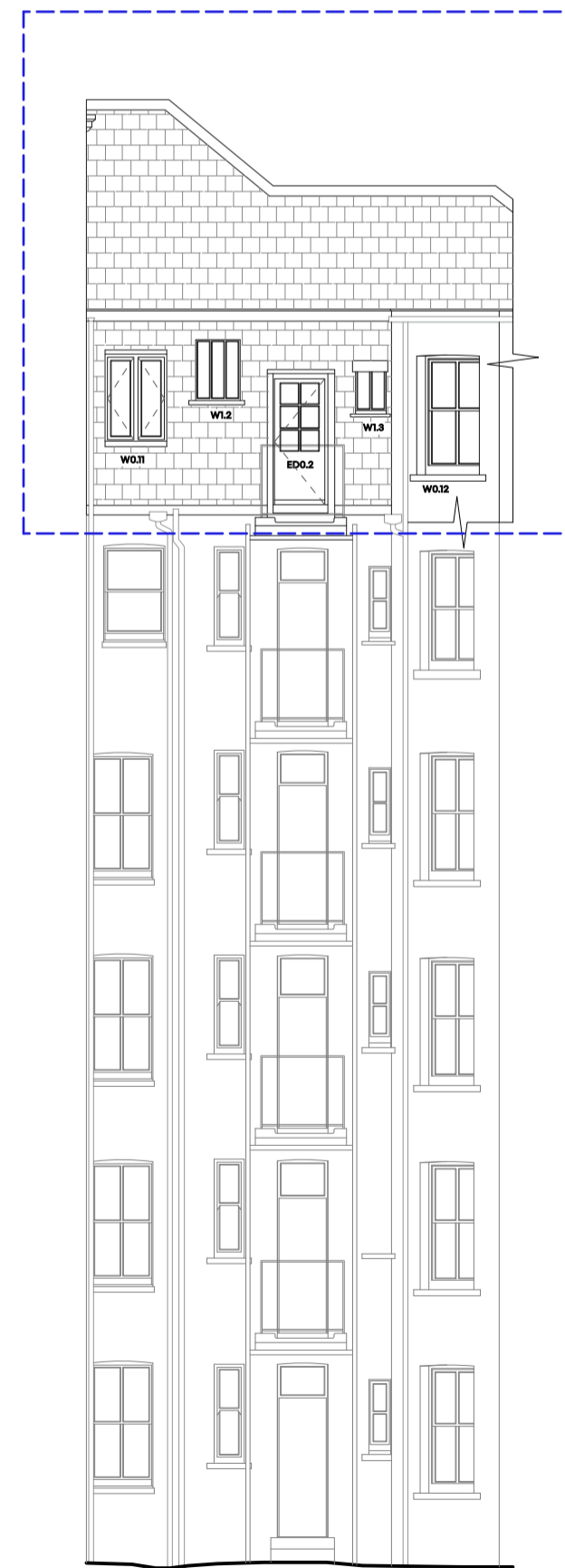
4 Existing South-West Lightwell Elevation 1:100 @A1