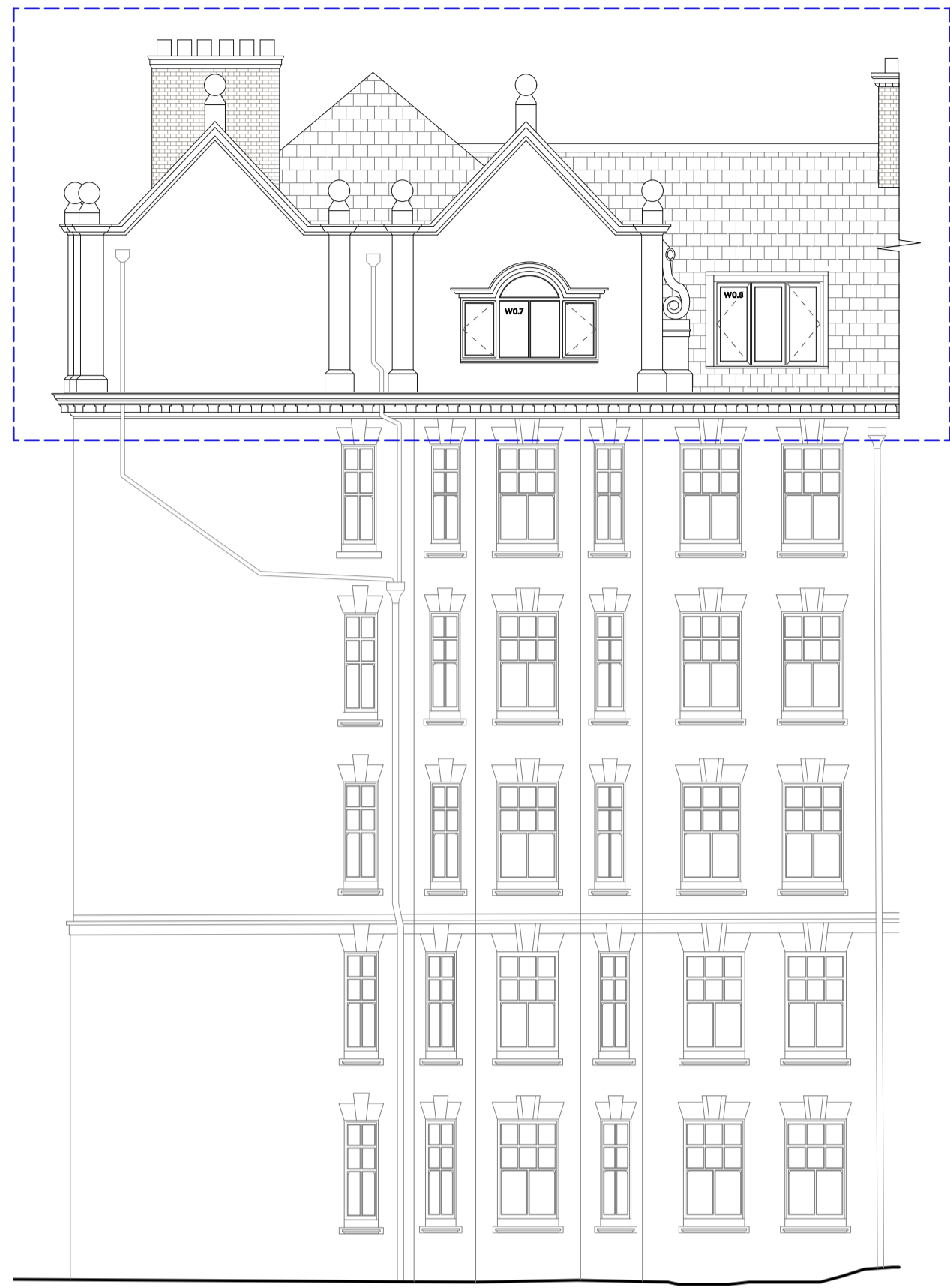
1 Existing North-West Elevation 1:100 @A1