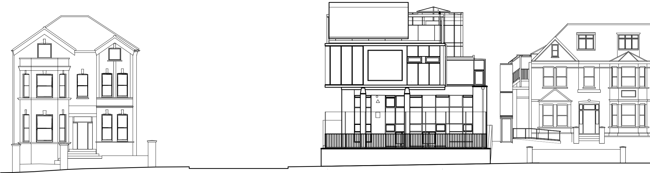
1 EXISTING FRONT ELEVATION