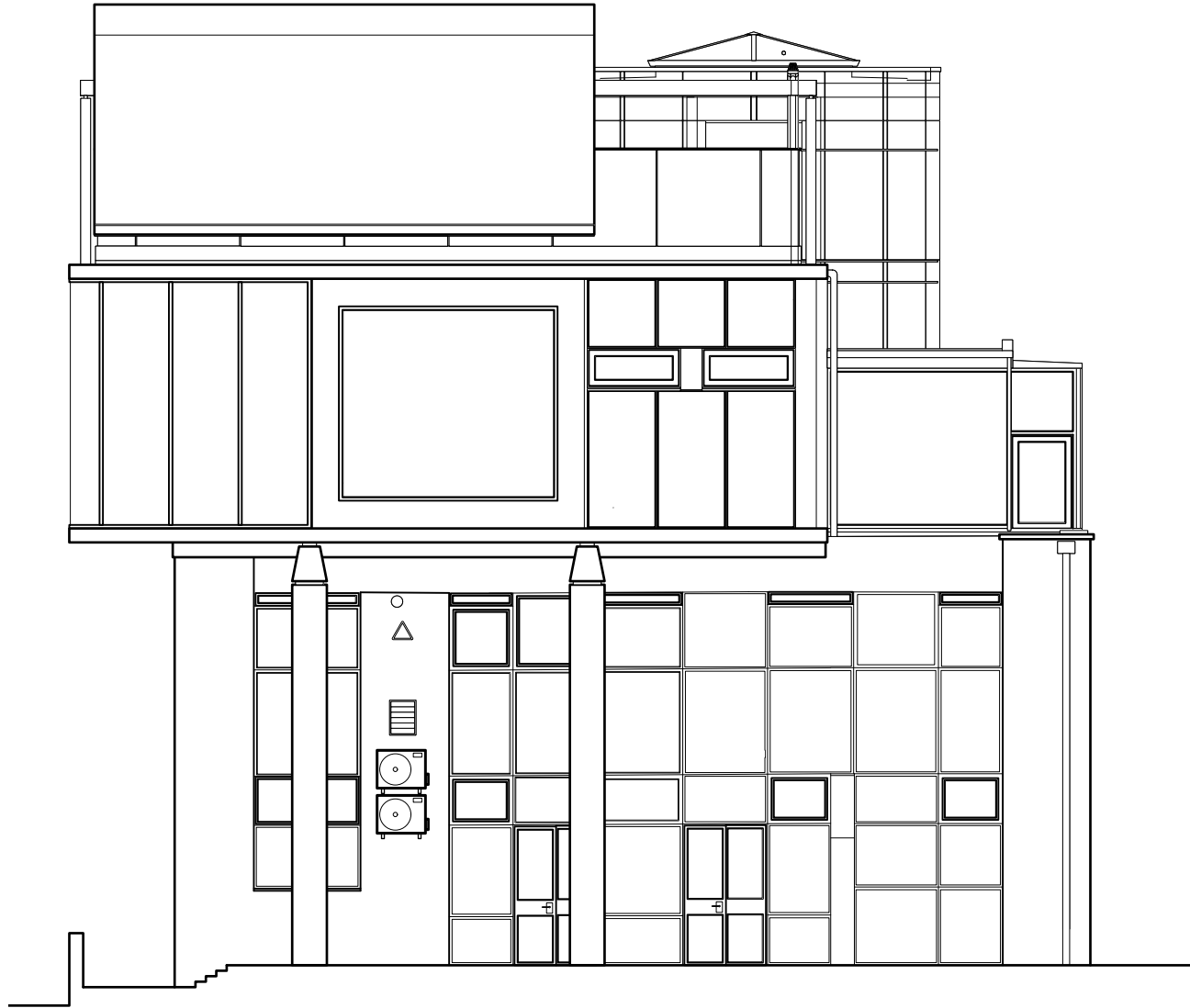
2 PROPOSED BUILDING FRONT ELEVATION