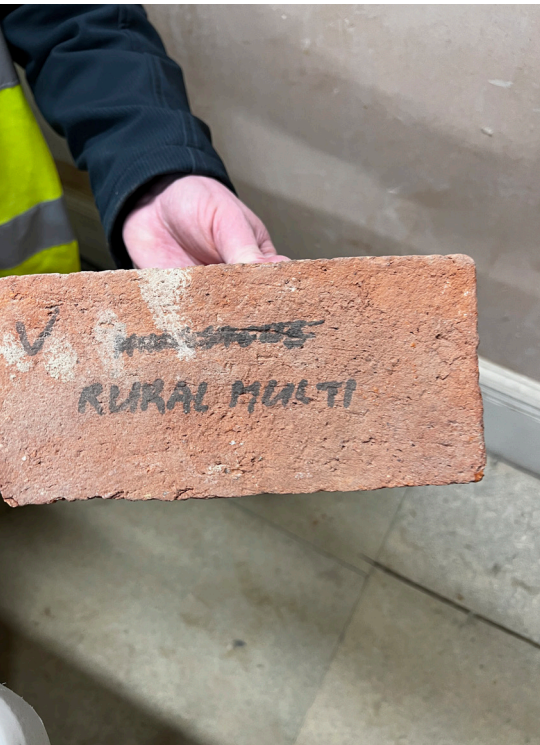
8. Rural Multi brick