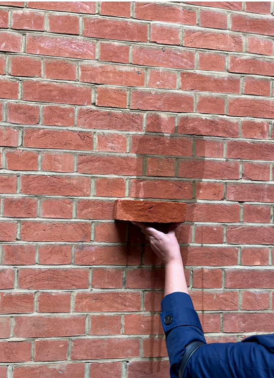
6. Colour matched to external wall