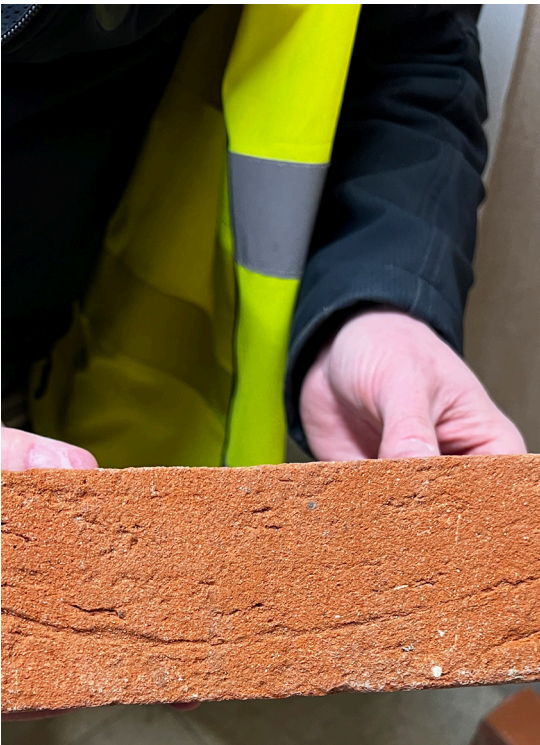
9. Face of Rural Multi brick