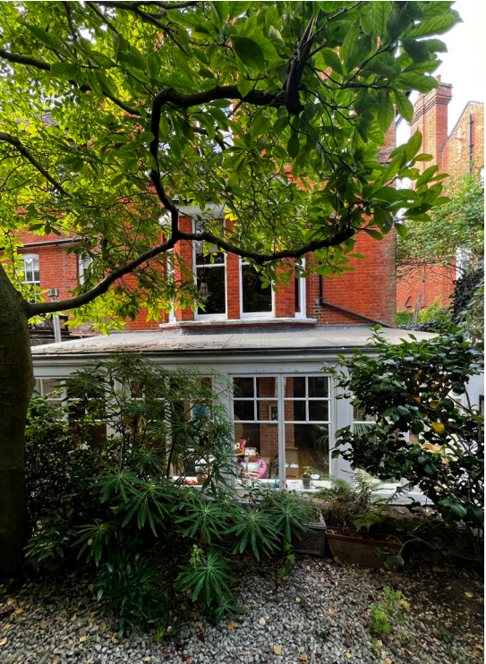
1. Extension prior to demolition