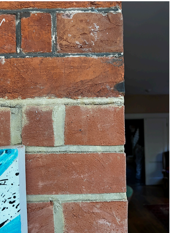
3. New brick dating back to 2001