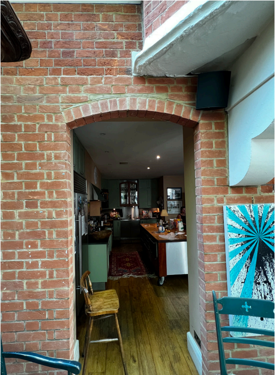
2. Note new and old brickwork