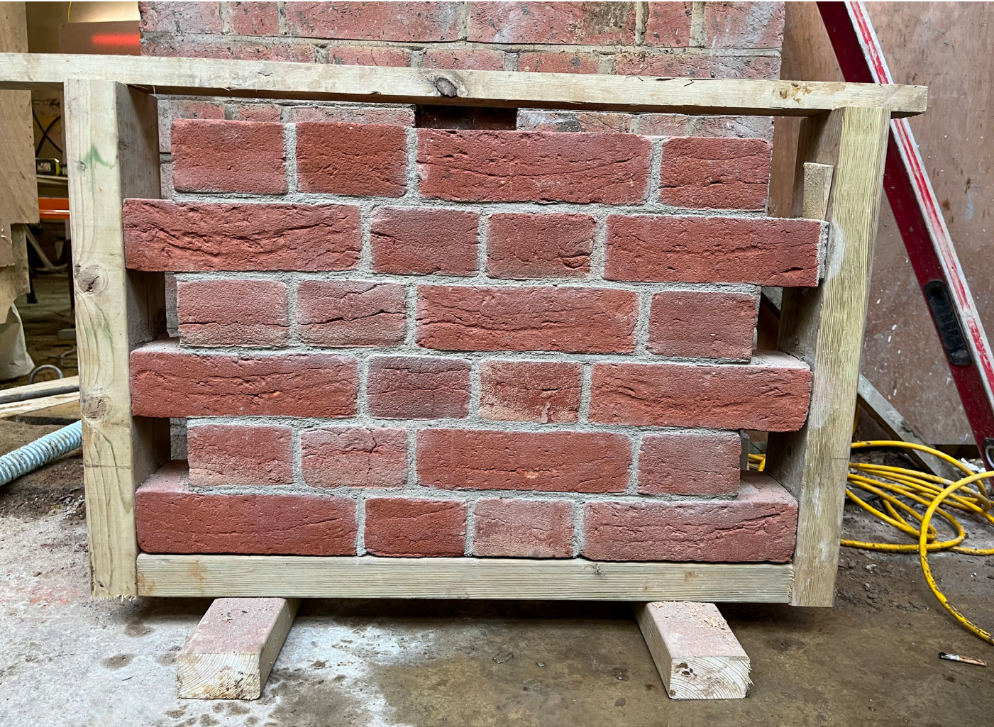
Image 05: Proposed Rural Multi brick sample using the running bond and lime mortar to match existing brick walls.

The brick colour and bond pattern has been carefully matched on site by testing several sample bricks. The lime mortar to the bricks was also carefully mixed with a dye to create a weathered and stained appearance.