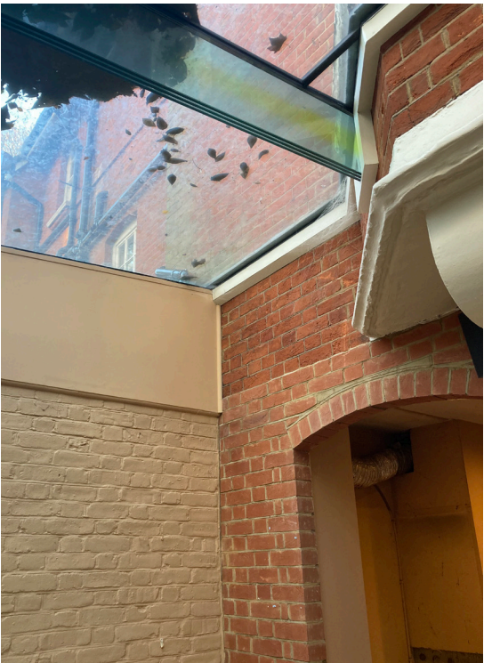
4. Distinct banding of different bricks