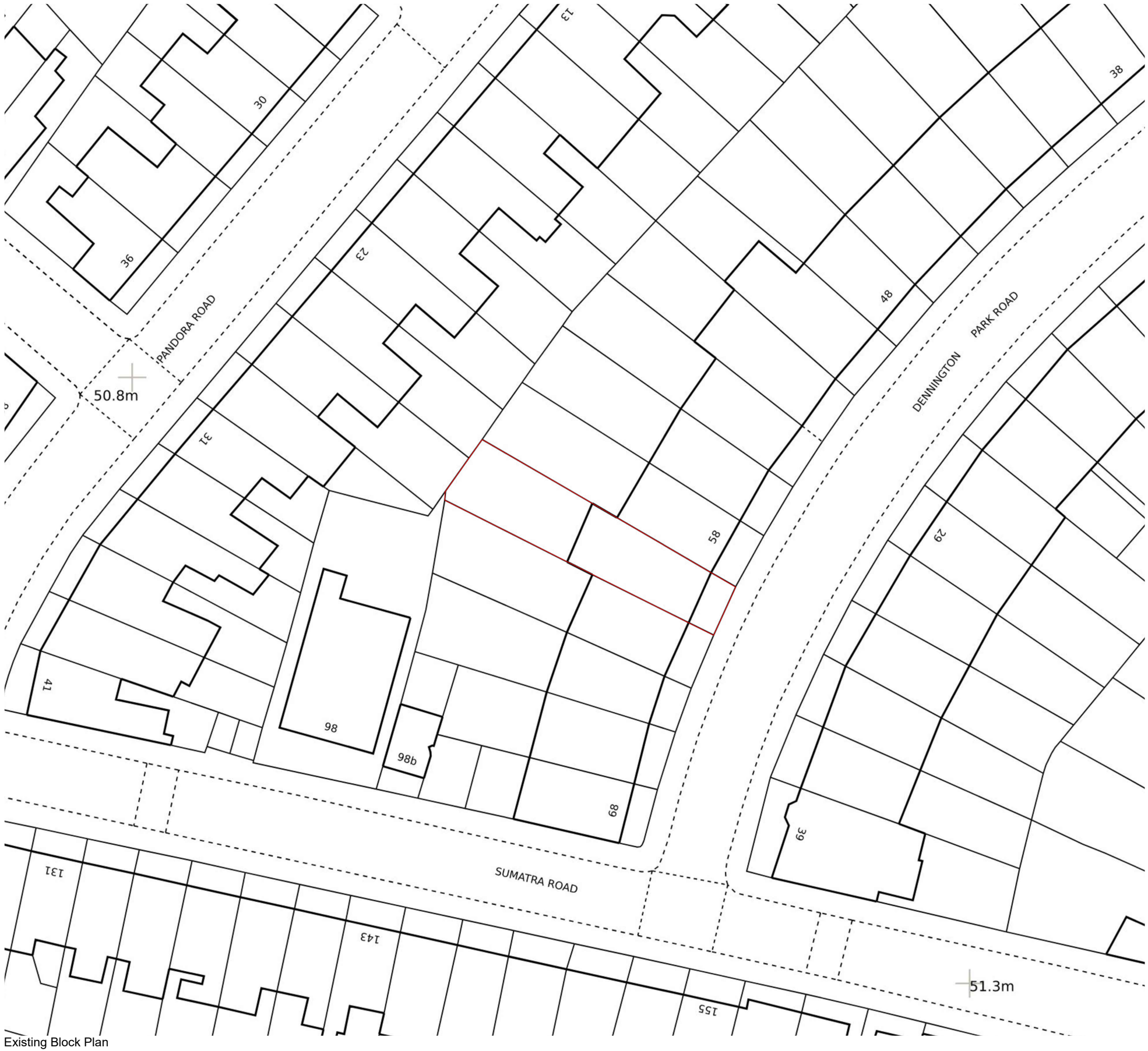
Existing Block Plan

Any dimensions shown should be checked on site and discrepancies reported to the Architect prior to construction. Designs are not coordinated with engineer projects. Do not scale for construction purposes.