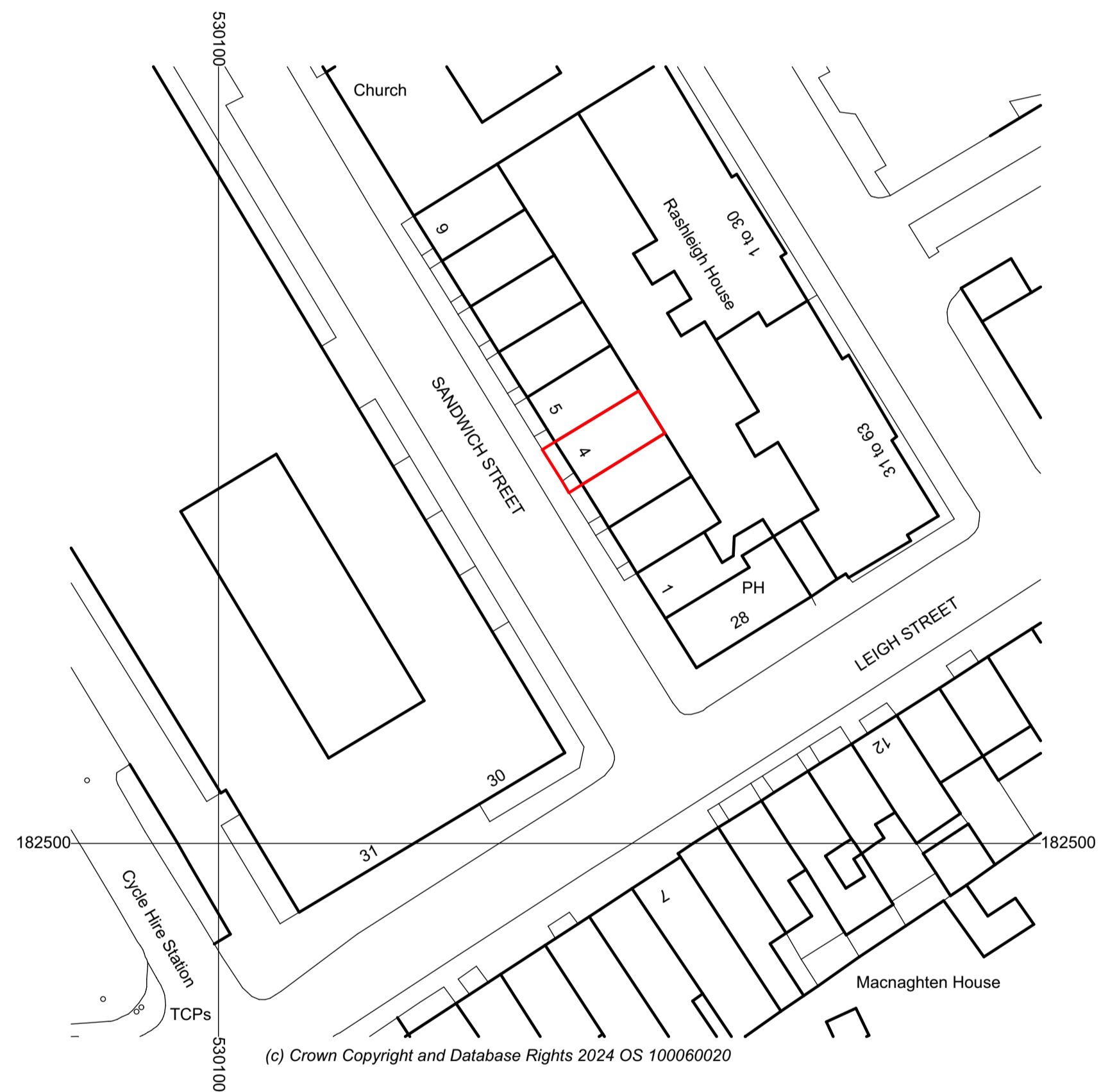
02 Block Plan 1:500