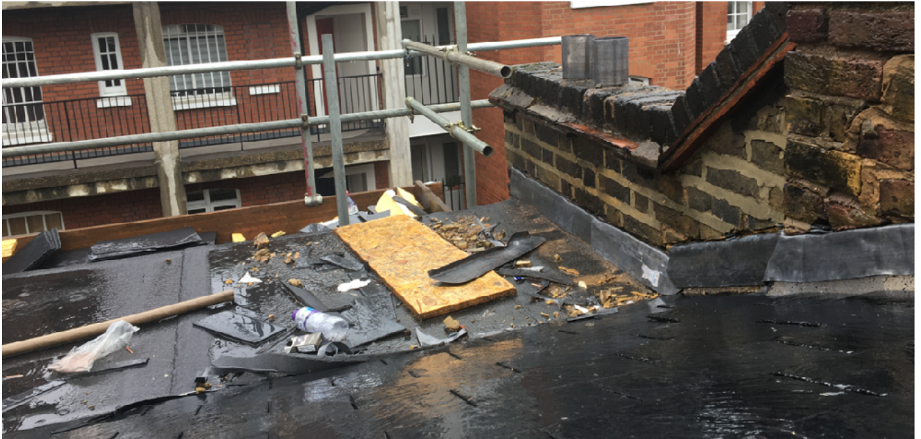
Photo 07 during construction

Contractor's photo showing rear flat roof during works including: new installed natural slate roof covering, existing chase cut lead flashings have not been repaired yet, new roof felting system is being installed with waterproofing.