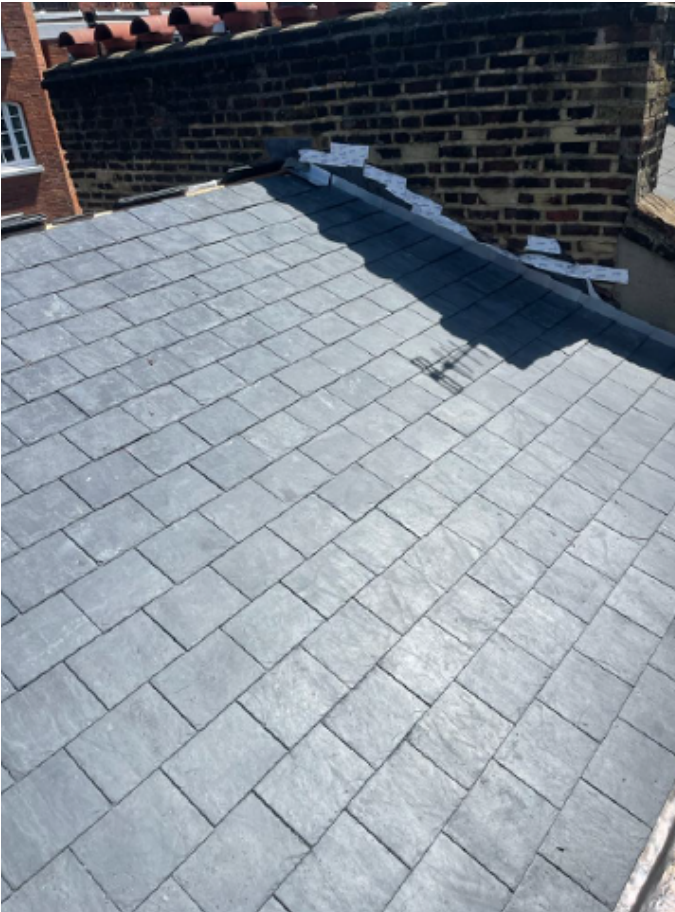
Photo 04 During construction

Contractor's photo showing roof during works including: new installed natural slate roof covering, concrete ridge tiles have been removed, chimney ready for repair and new lead flashing.