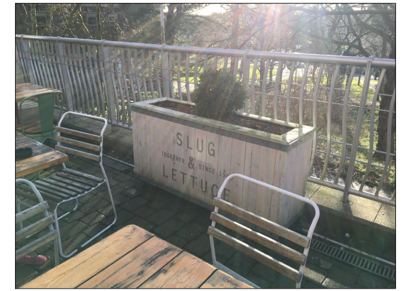
proposed planters - timber framed similar to this style, fitted with wheels and planted with faux planting 1200mmx400mmx900mm high