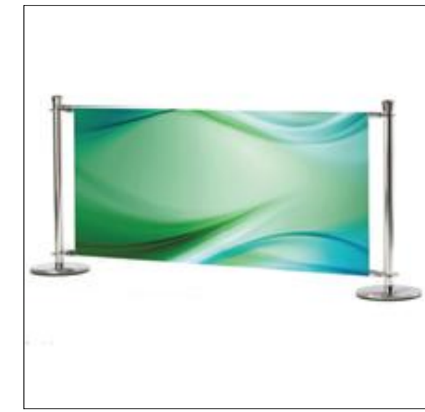
proposed side barriers - stainless steel posts with branded cafe barrier inserts - 1400mm long x 1000mm high