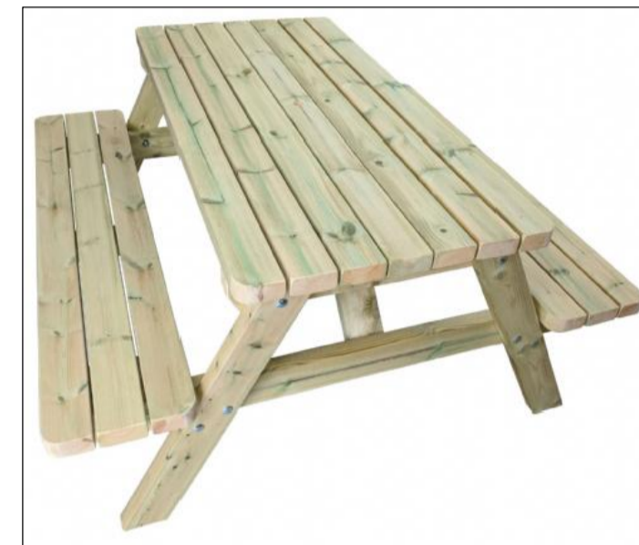
proposed A frame benches 1400mm wide x 1500mm long