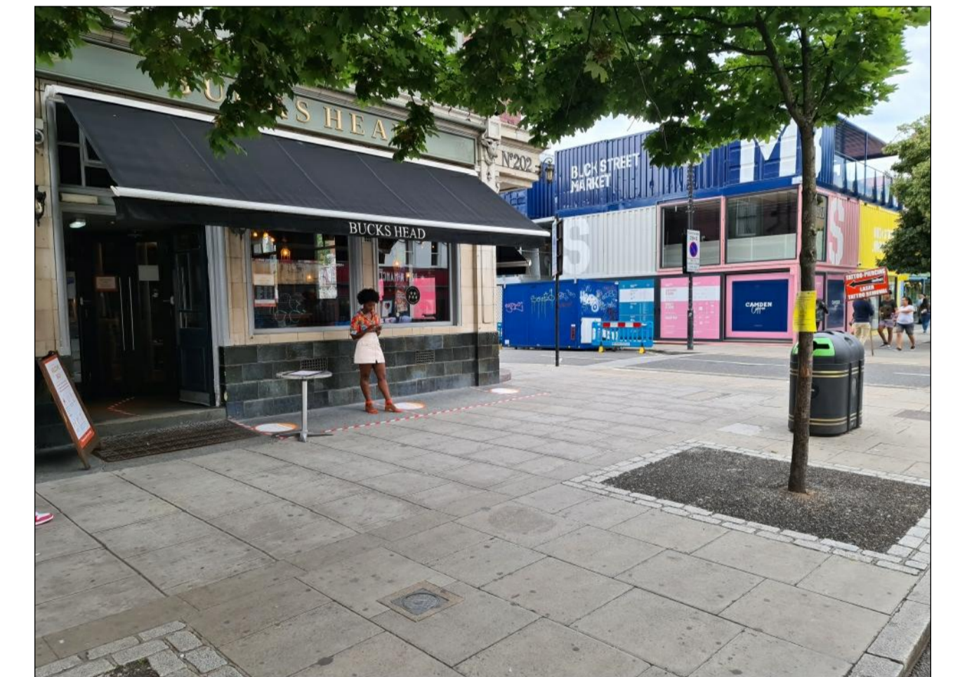
existing photograph of external pavement area