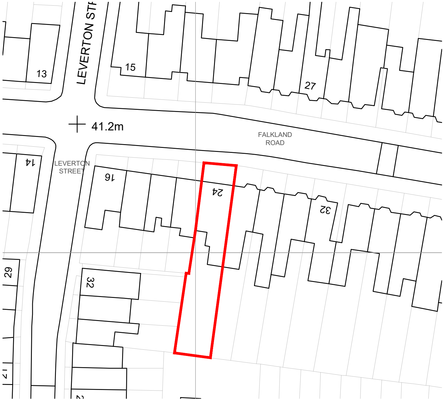
Block plan 1:500 @ A3