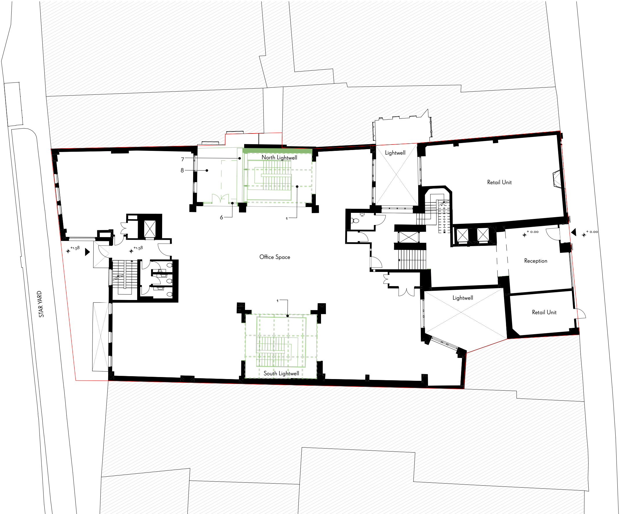
Proposed Ground Floor Plan 1:200

35 PITFIELD STREET LONDON N1 6HB +44 (0) 2076135727 WAUGHTHISTLETON.COM