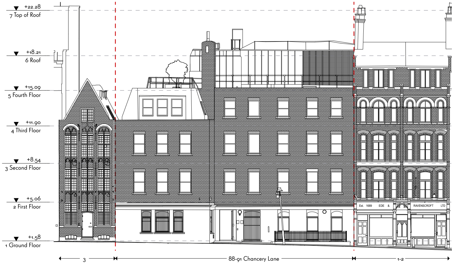
Existing West Elevation - Star Yard 1:200