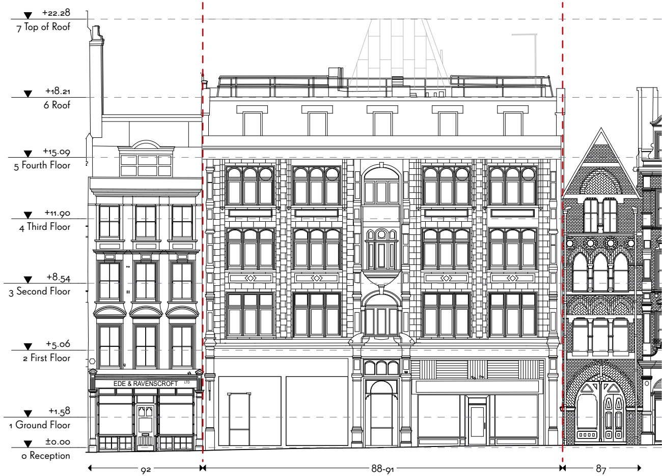
Existing East Elevation - Chancery Lane 1:200