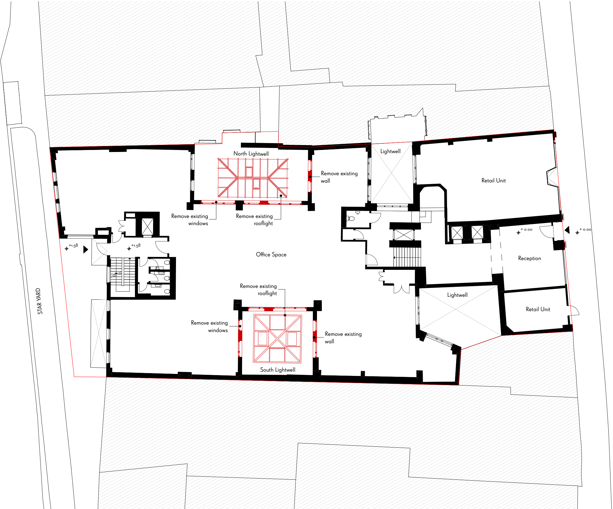
Demolition Ground Floor Plan 1:200

35 PITFIELD STREET LONDON N1 6HB +44 (0) 2076135727 WAUGHTHISTLETON.COM