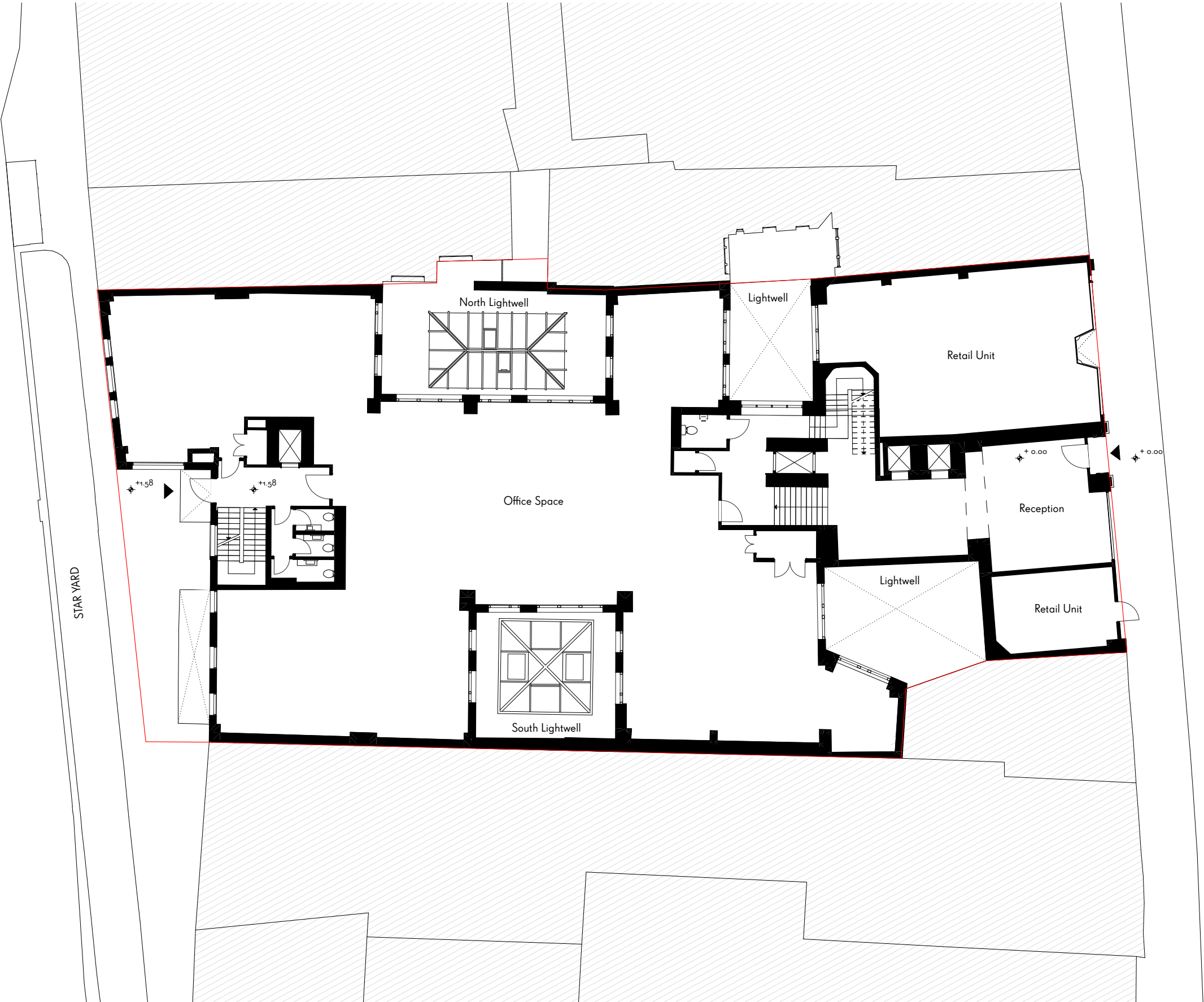
Existing Ground Floor Plan 1:200