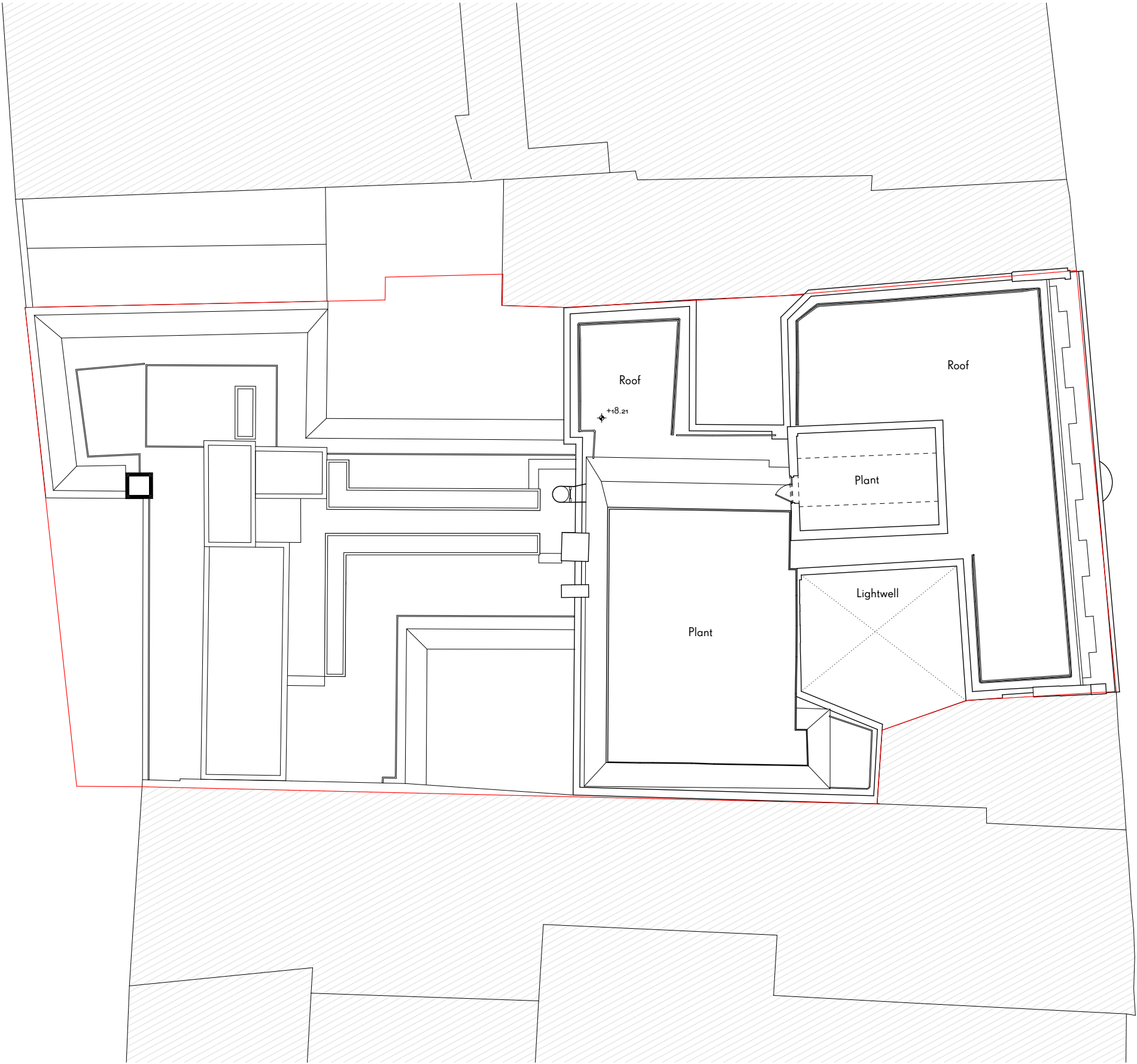
Existing Roof Plan 1:200

35 PITFIELD STREET LONDON N1 6HB +44 (0) 2076135727 WAUGHTHISTLETON.COM