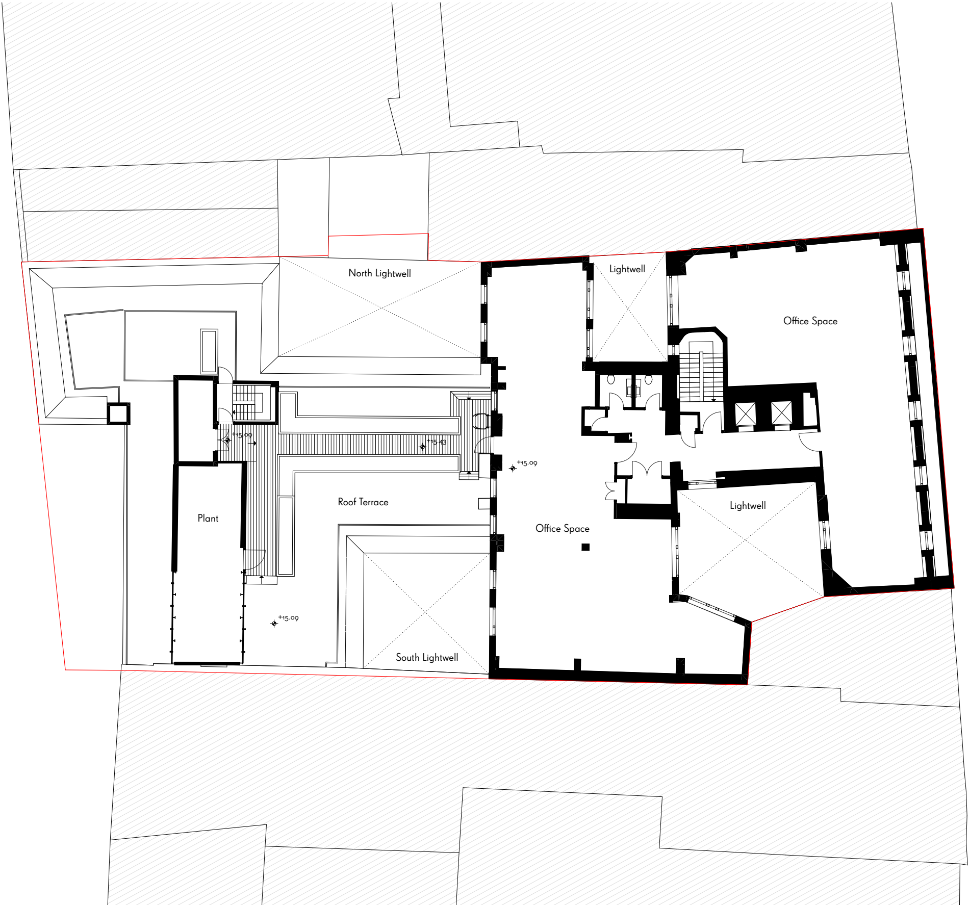
Existing Fourth Floor Plan

35 PITFIELD STREET LONDON N1 6HB +44 (0) 2076135727 WAUGHTHISTLETON.COM