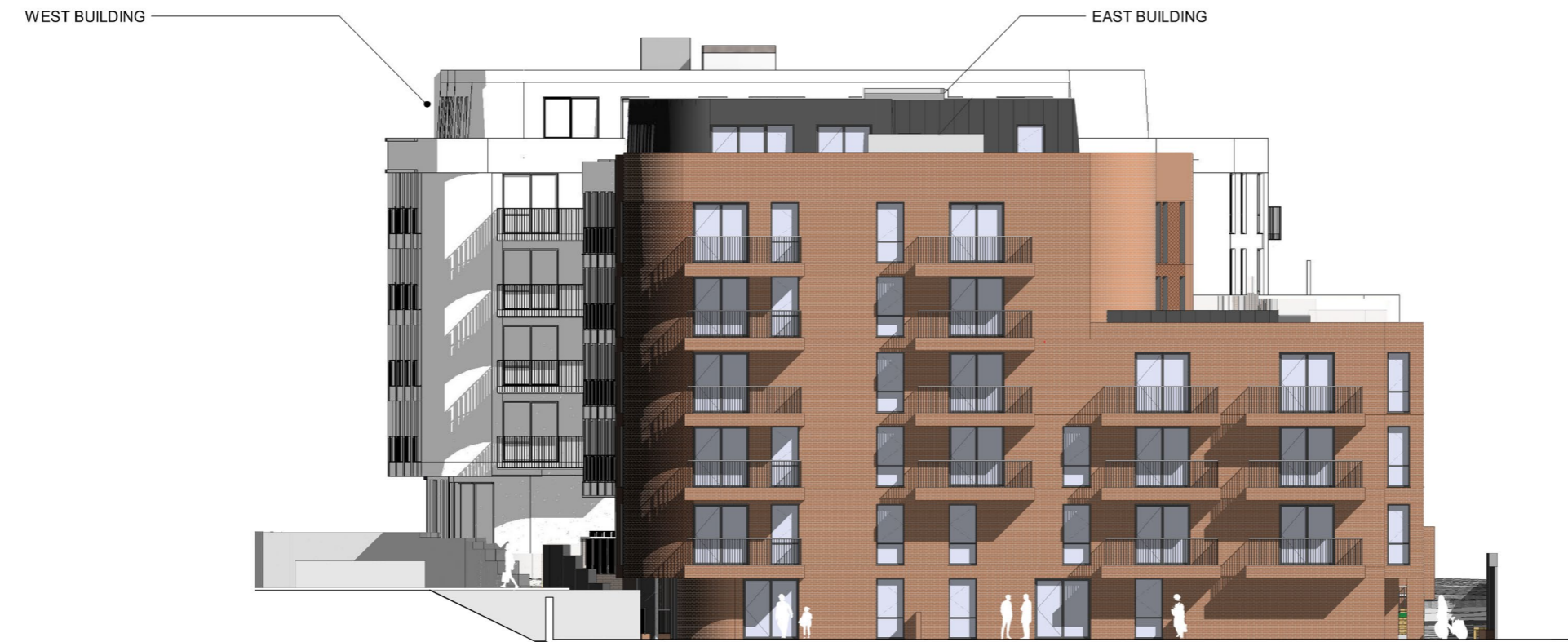
East Elevation - scale 1:250