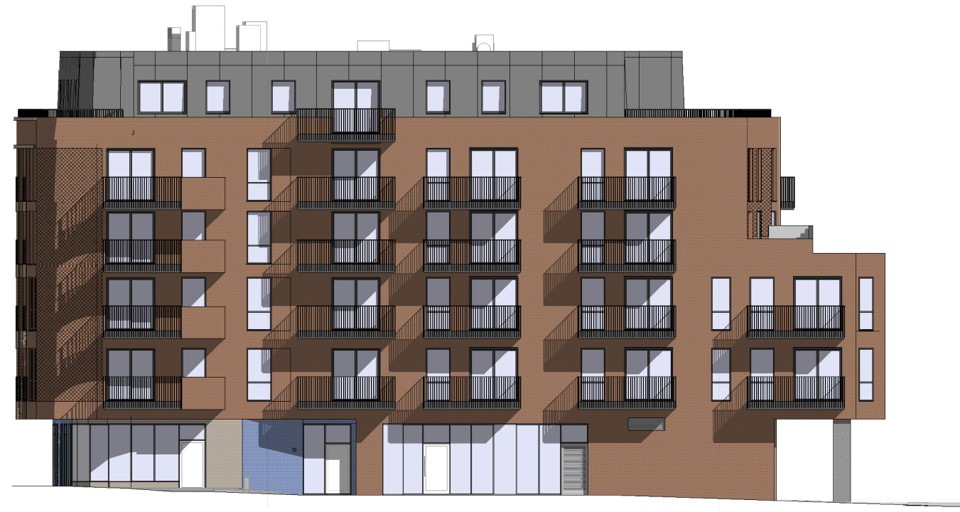
East Elevation - scale 1:250