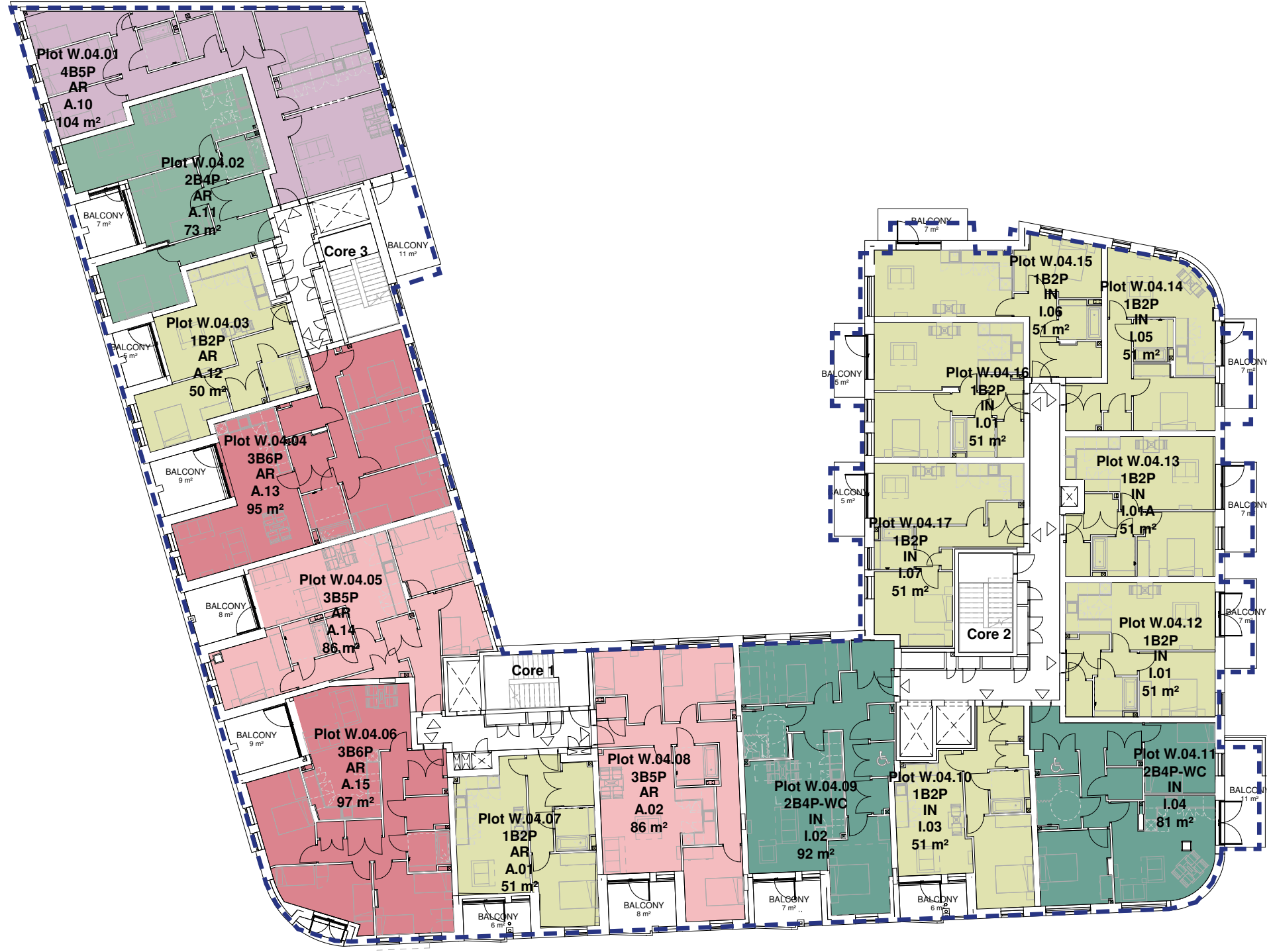
Proposed Fourth Floor Plan - scale 1:250

NOTES THIS DRAWING MUST NOT BE SCALED. ALL DIMENSIONS ARE TO BE VERIFIED AND CHECKED ON SITE. ANY DISCREPANCIES THAT ARE, OR BECOME APPARENT SHOULD BE REPORTED TO CHAPMAN TAYLOR. AREAS INDICATED ARE APPROXIMATE GROSS INTERNAL AREA. THEY RELATE TO THE LIKELY AREA OF THE BUILDING AT THE CURRENT STAGE OF DESIGN. ANY DECISIONS TO BE MADE ON THE BASIS OF THESE PREDICTIONS, WHETHER AS TO PROJECT VIABILITY, PRE-LETTING, LEASE AGREEMENTS, OR THE LIKE, SHOULD INCLUDE DUE ALLOWANCE FOR THE INCREASES AND DECREASES INHERENT IN THE DESIGN DEVELOPMENT AND BUILDING PROCESS. © COPYRIGHT CHAPMAN TAYLOR 2020