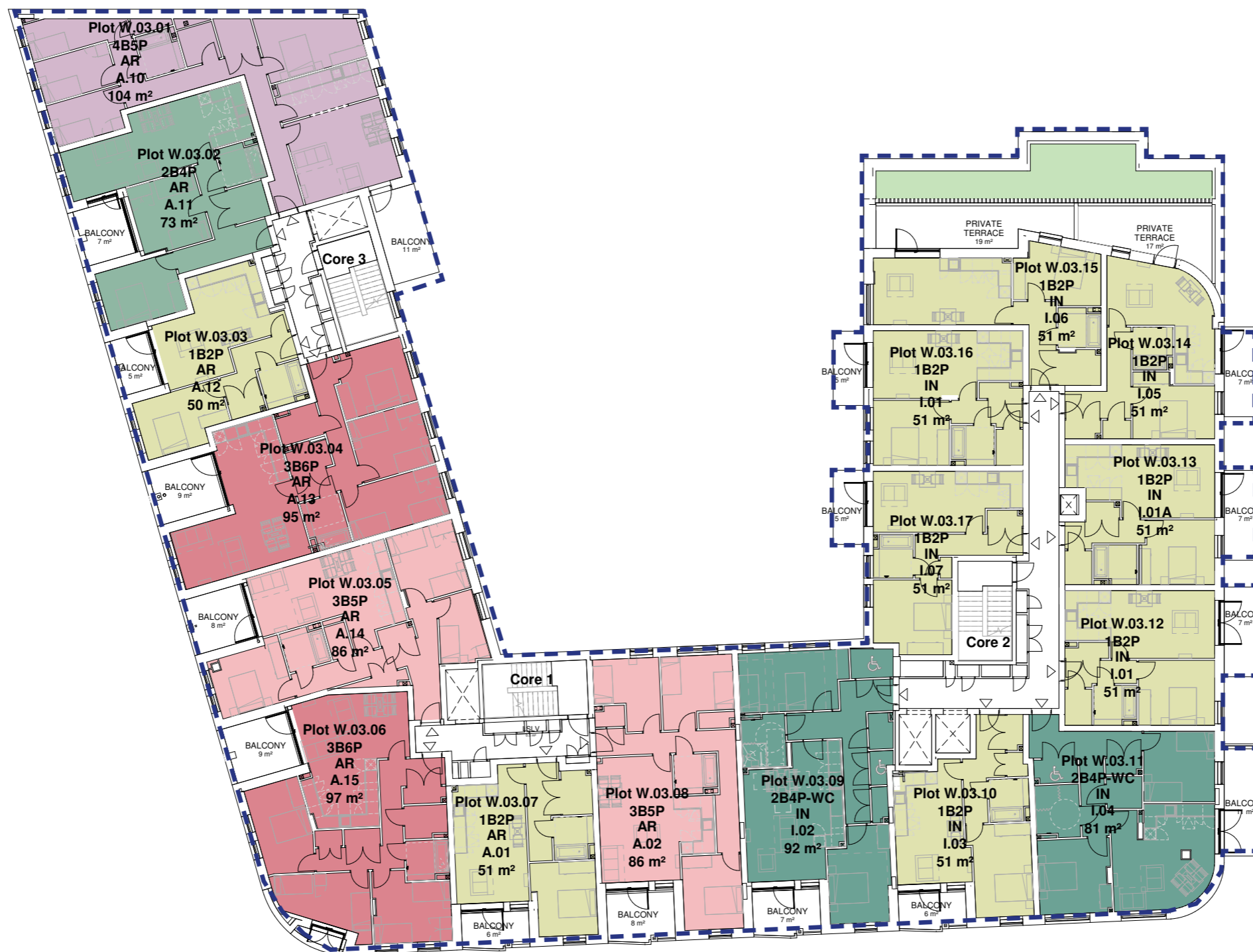
Proposed Third Floor Plan - scale 1:250