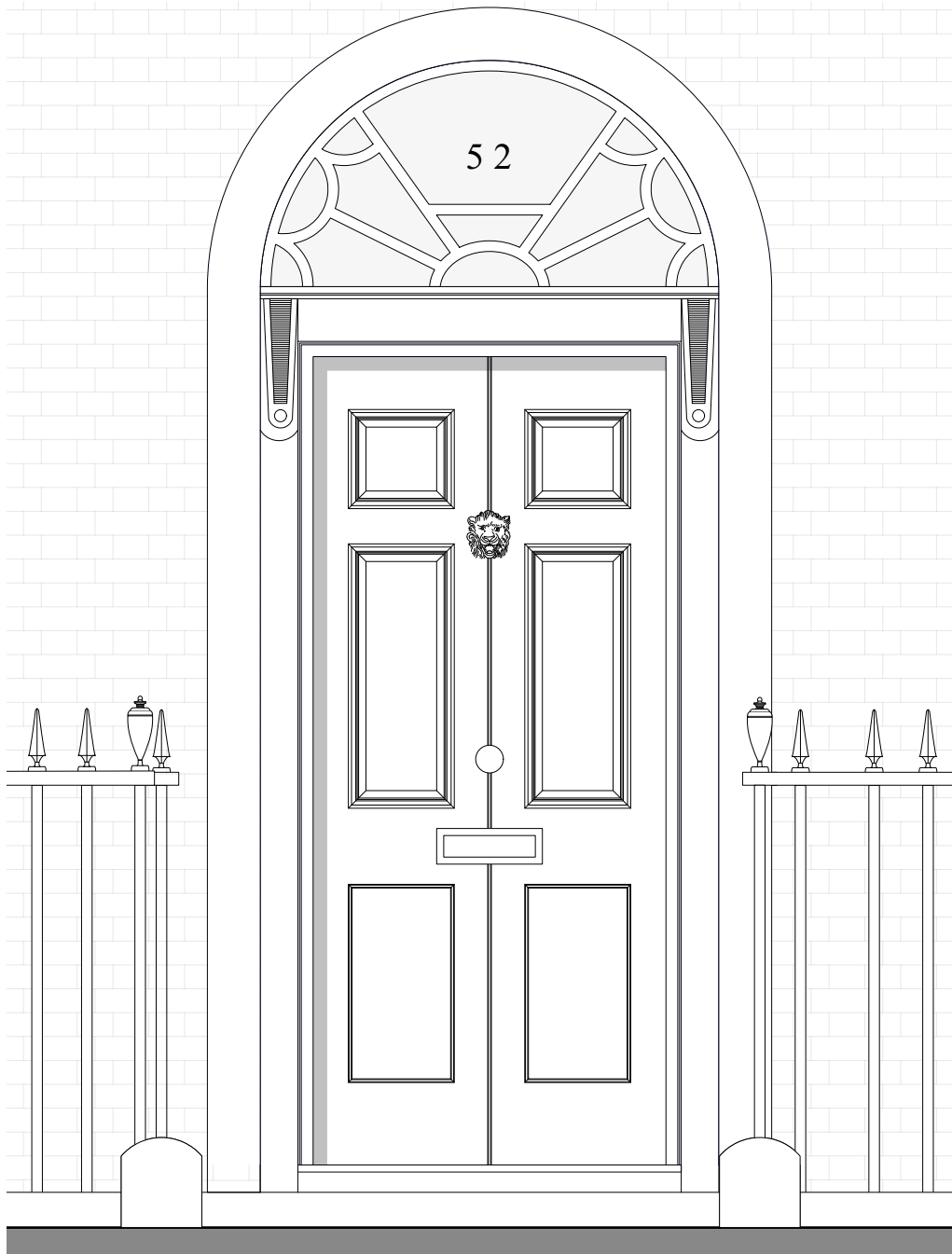
E Front Door Elevation 1:20