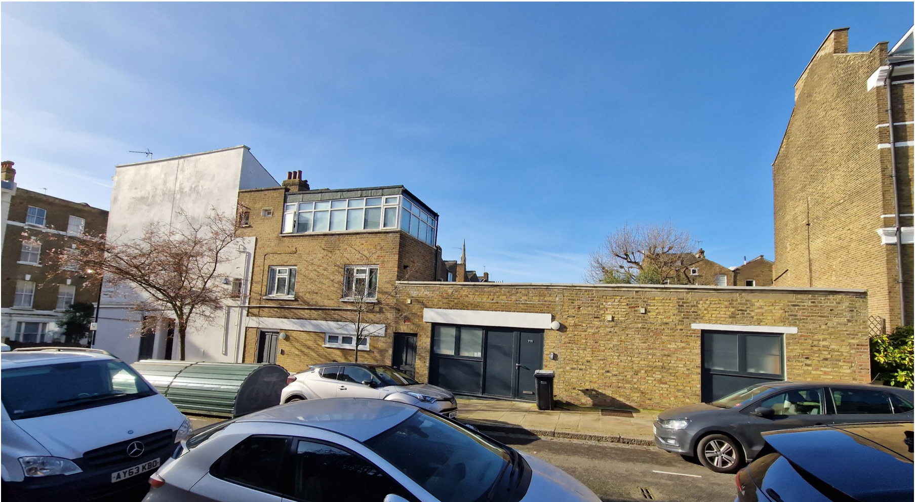
PH3 - Side View from Montpelier Grove