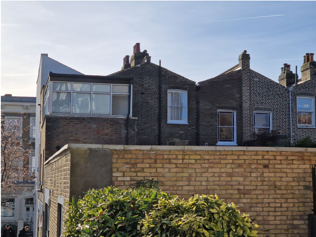
PH2 - Rear View from Montpelier Grove