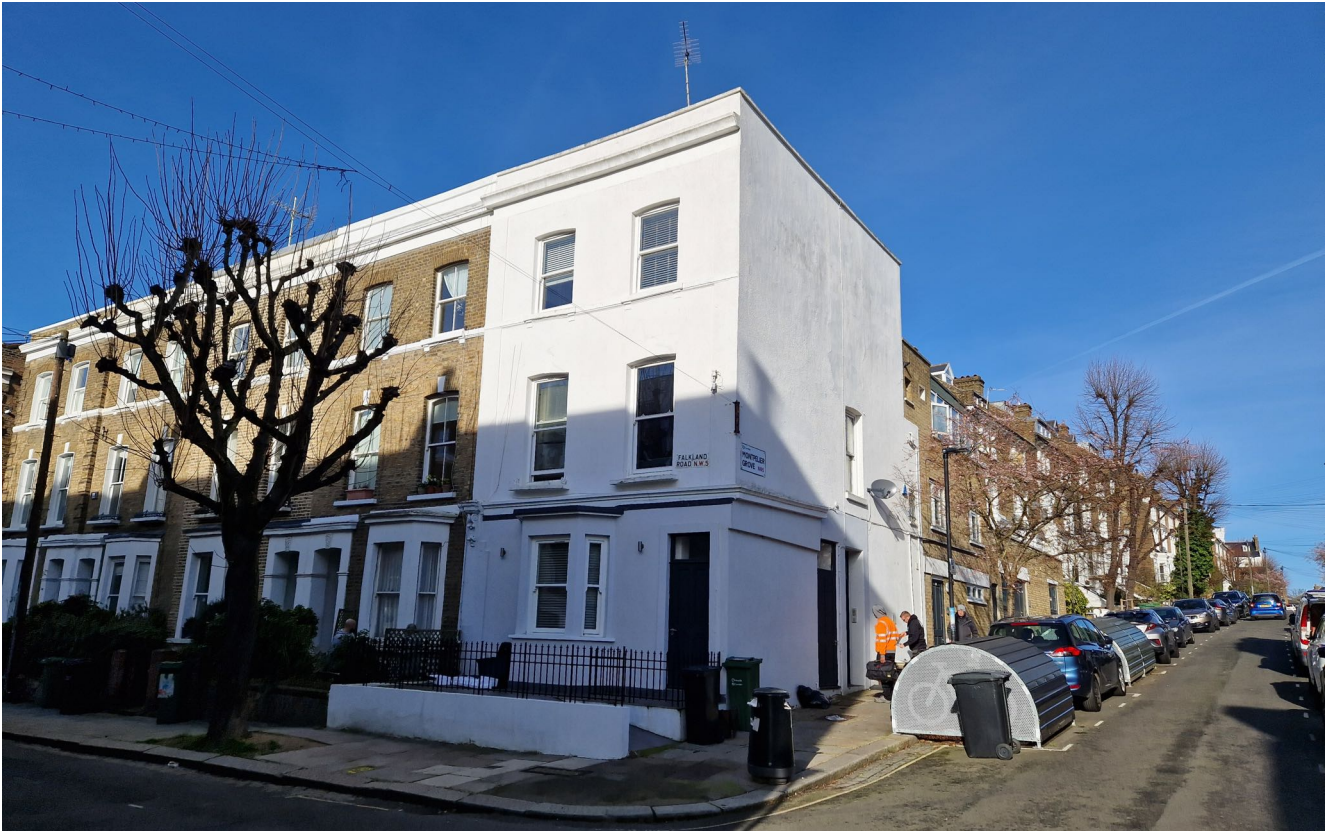
PH1 - Front View from Falkland Road