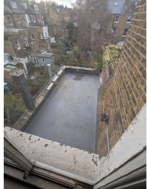
Views of the existing AGA flue showing it discharging just above the 2 nd floor roof terrace.

We therefore propose to amend the proposals to include a new external flue fixed to the southern flank of the rear chimney stack. To ensure no nuisance is caused to the 2 nd floor terrace or the neighbouring properties, the proposed flue will extend above the existing stack to the level of the top of the dormer. The proposed flue will be 125mm in diameter and painted black to have a similar appearance to the existing soil vent pipe and rainwater goods.