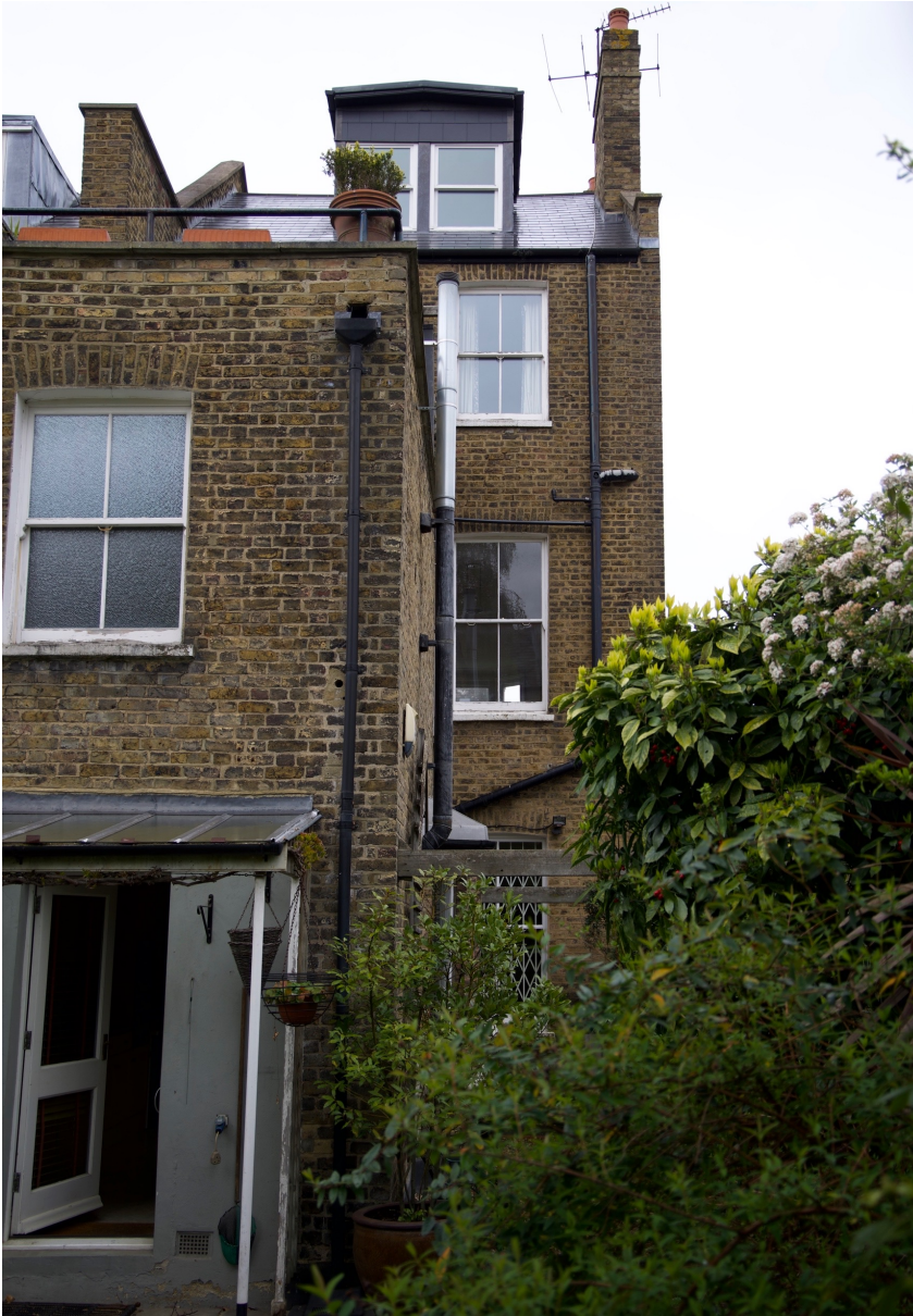
Rear view of 1 Courthope Road showing the existing AGA flue on the south face of the rear wing. Also shown are the black painted rainwater goods and SVP to which the new flue will have a similar appearance.