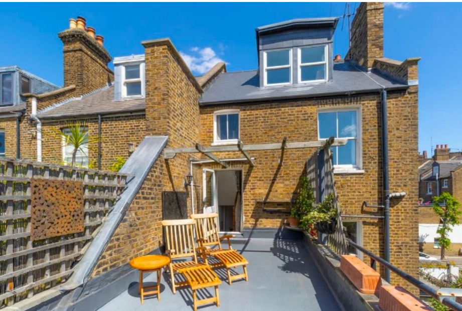
Rear terrace showing the chimney stack to which the proposed flue will be attached

916.002A, 916.003A, 916.004A, 916.005A, 916.010B, 916.007A, 918.008B, 918.009B, 916.271A, 916.272A, 916.273A, 916.274A, 916.275A, 916.277A, 916.278A, 916.279A , S-100.