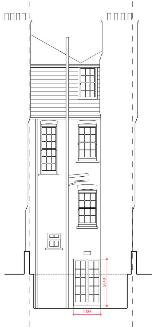
Existing: Rear (West) Elevation