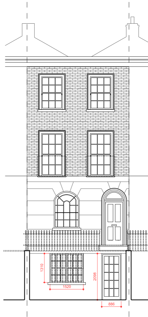
Existing: Front (East) Elevation