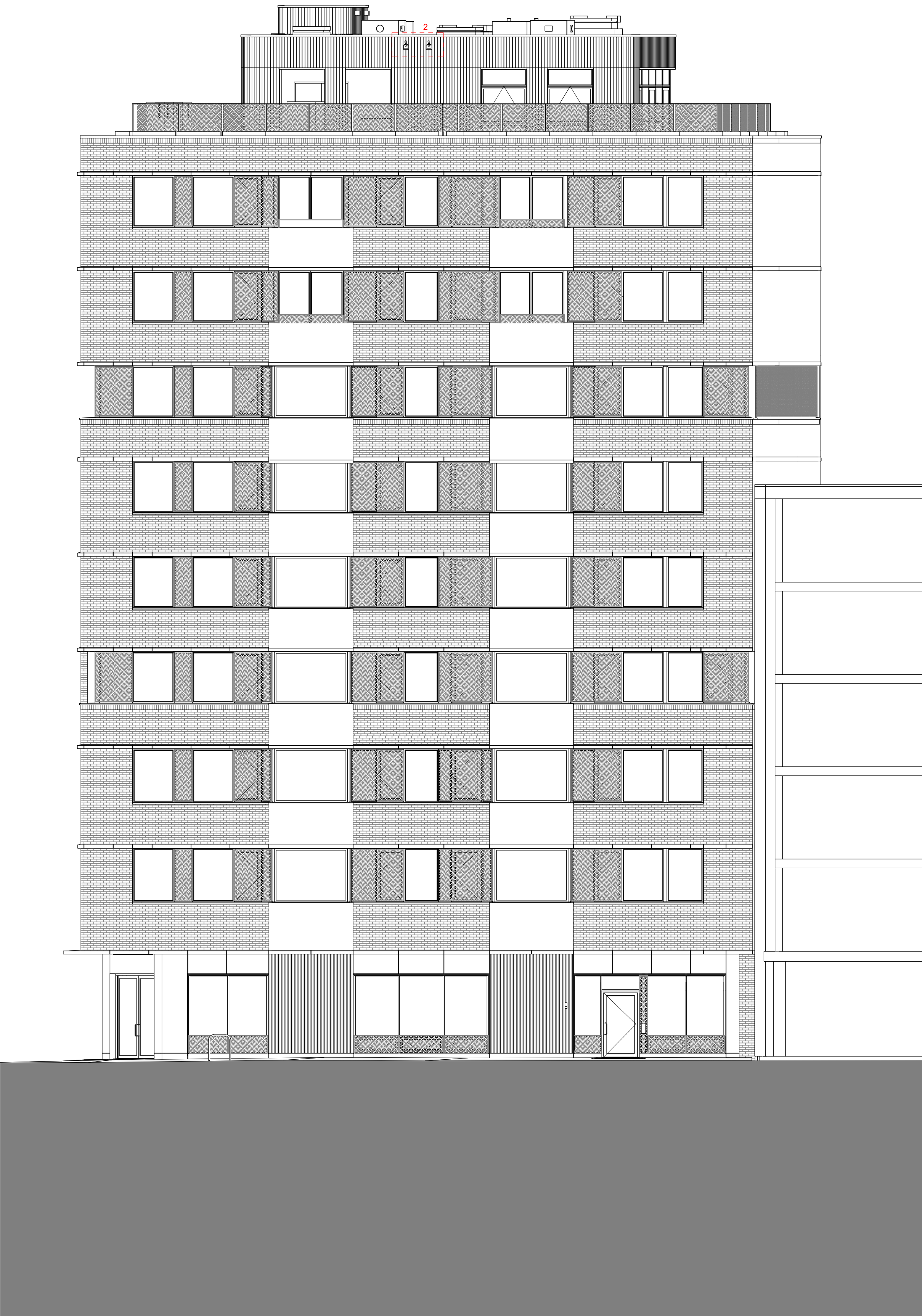
2 ELEVATION_SOUTH WEST (1-100) 1 : 100