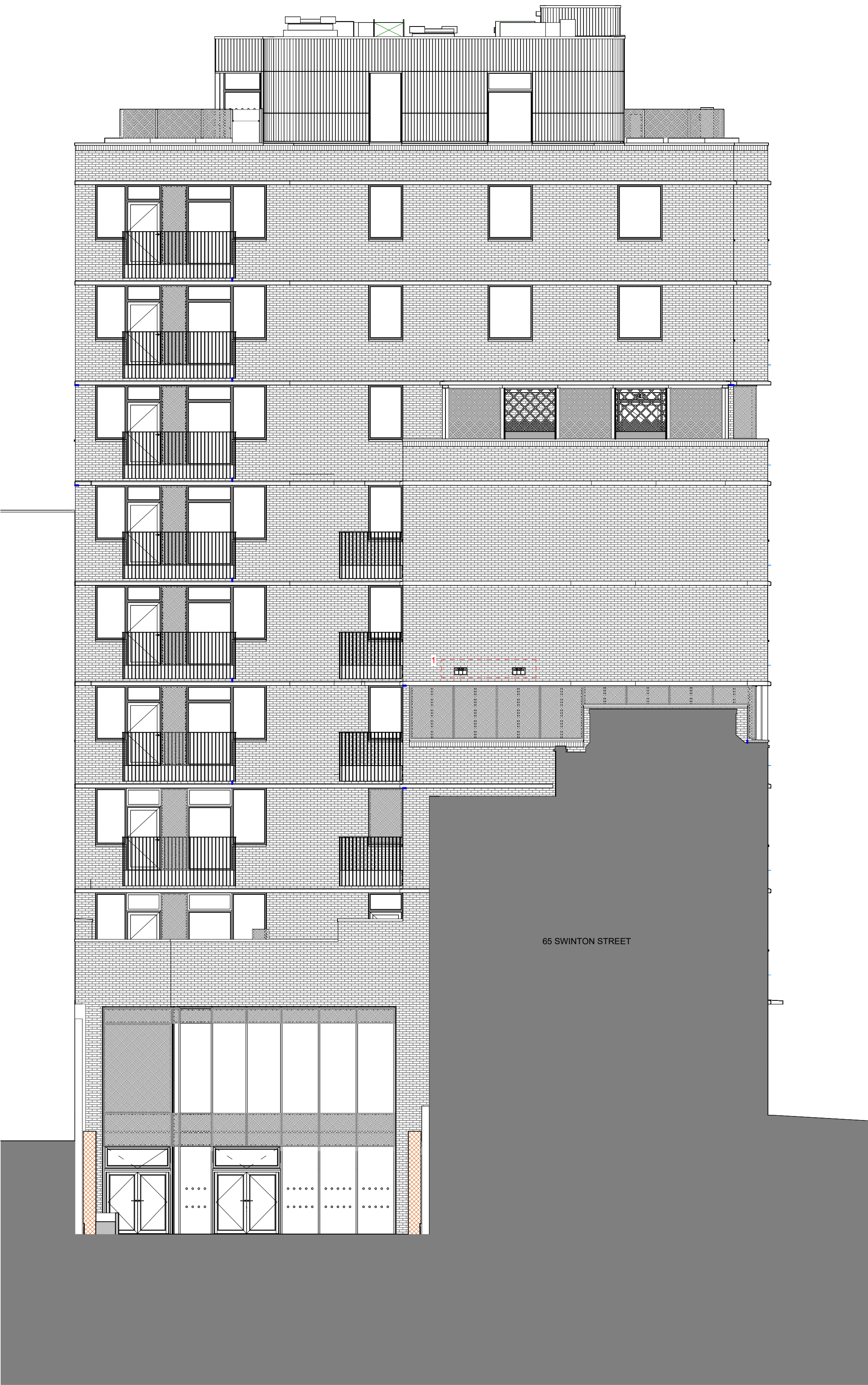
① ELEVATION NORTH EAST (1-100) 1 : 100

5361-BAL-XX-XX-DR-A-07-0010 | Revision P1 Pr Status