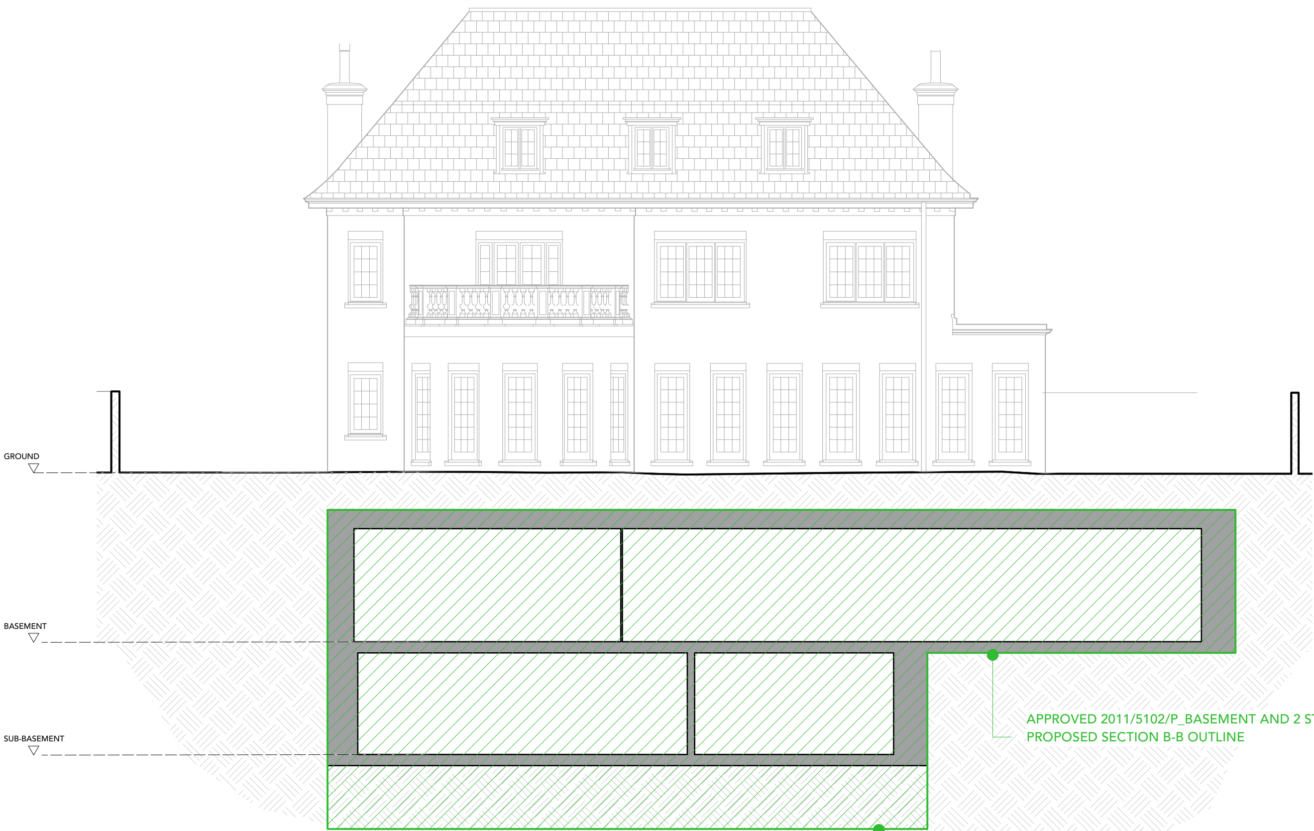
4 Approved Section A-A Scale - 1:100@A3