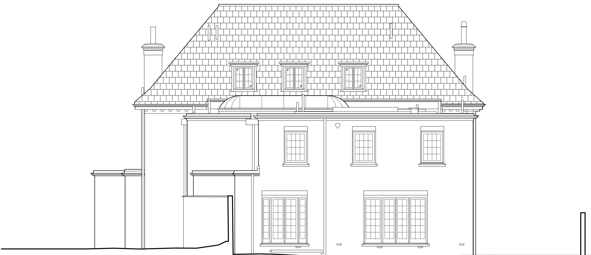
3 Approved Rear Elevation Scale - 1:100@A3