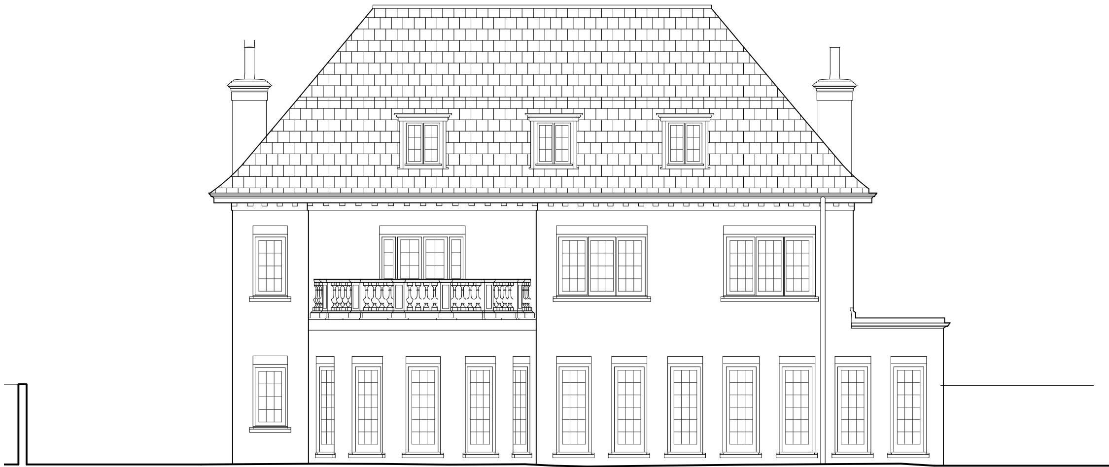
2 Existing Front Elevation Scale - 1:100@A3