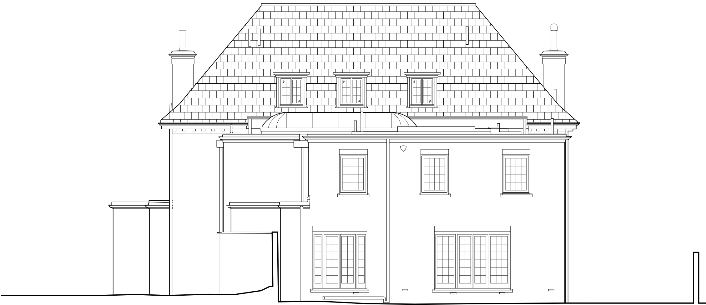
3 Existing Rear Elevation Scale - 1:100@A3