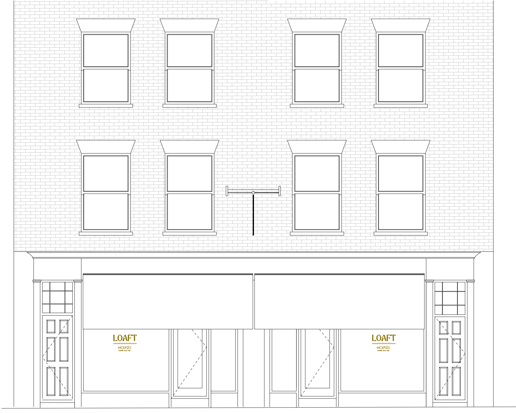
01 Proposed Front Elevation 1:50