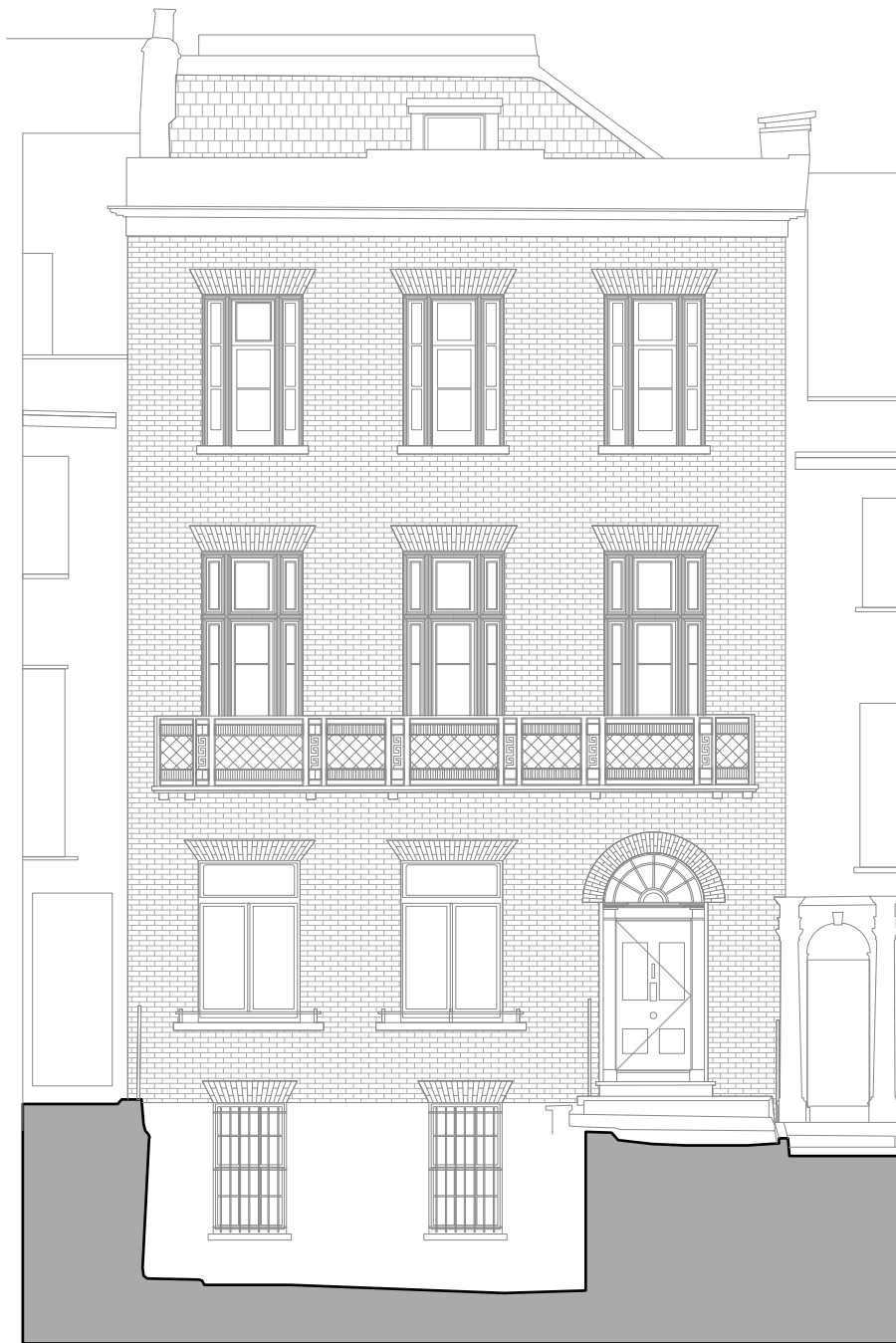
1 Existing Front Elevation 204 Scale 1:100@A3

+44 (0) 208 0655489 gareth@robertsandtreguer.co.uk www.robertsandtreguer.co.uk