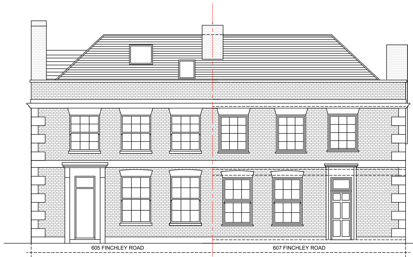
EXISTING FRONT ELEVATION SCALE: 1:100

This drawing is the property of Orb Property Planning Ltd and may not be reproduced, loaned or copied, in part or in full, without the prior written consent of Orb Property Planning Ltd. This drawing is not for construction purposes, unless otherwise stated. The Contractor is responsible for checking all dimensions before any work starts or any materials are ordered. Any discrepancies must be brought to the attention of Orb Property Planning Ltd immediately.