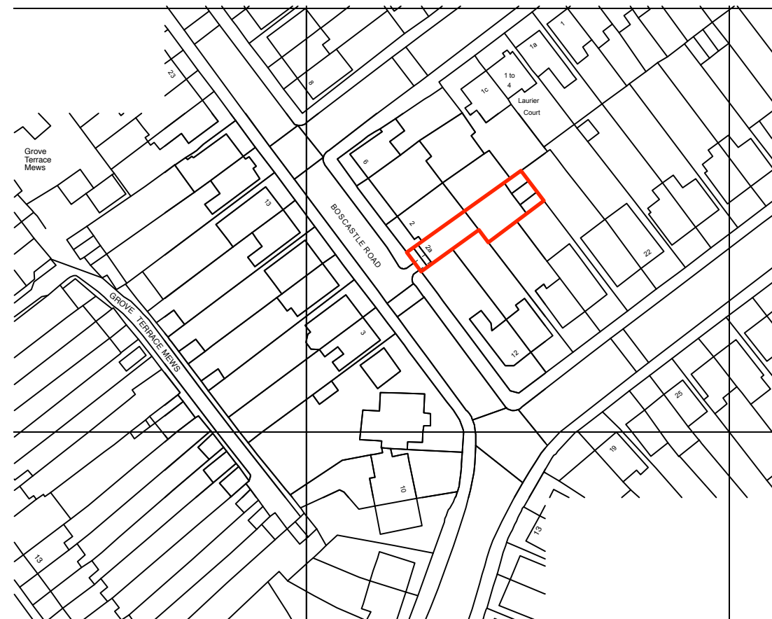
Location Plan (1:1250)