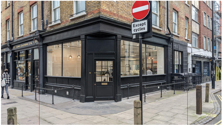
1 Site Elavation Photo 1 (including exisiting context)

32 Windmill Street (Site for the application)