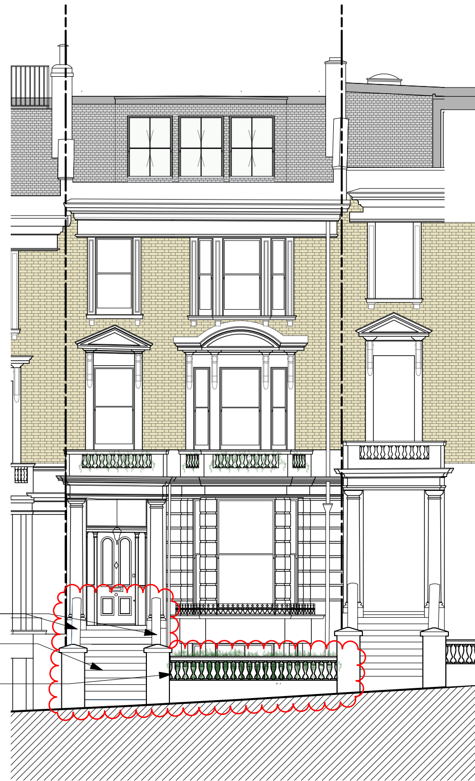
2 Front Elevation from Belsize Crescent