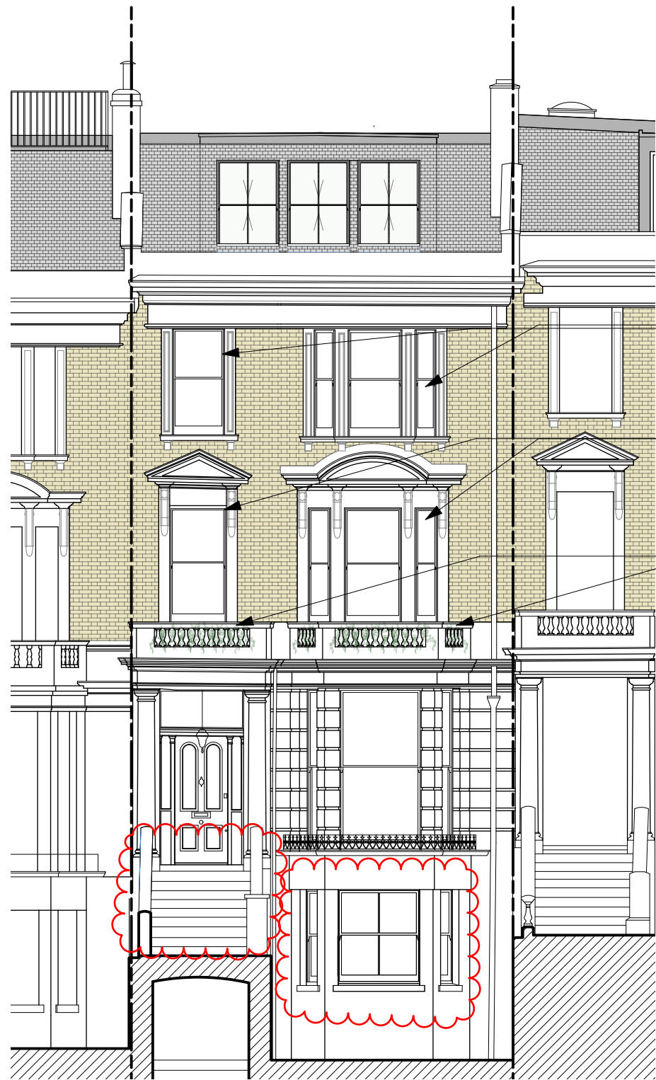
1 Front Elevation through lightwell