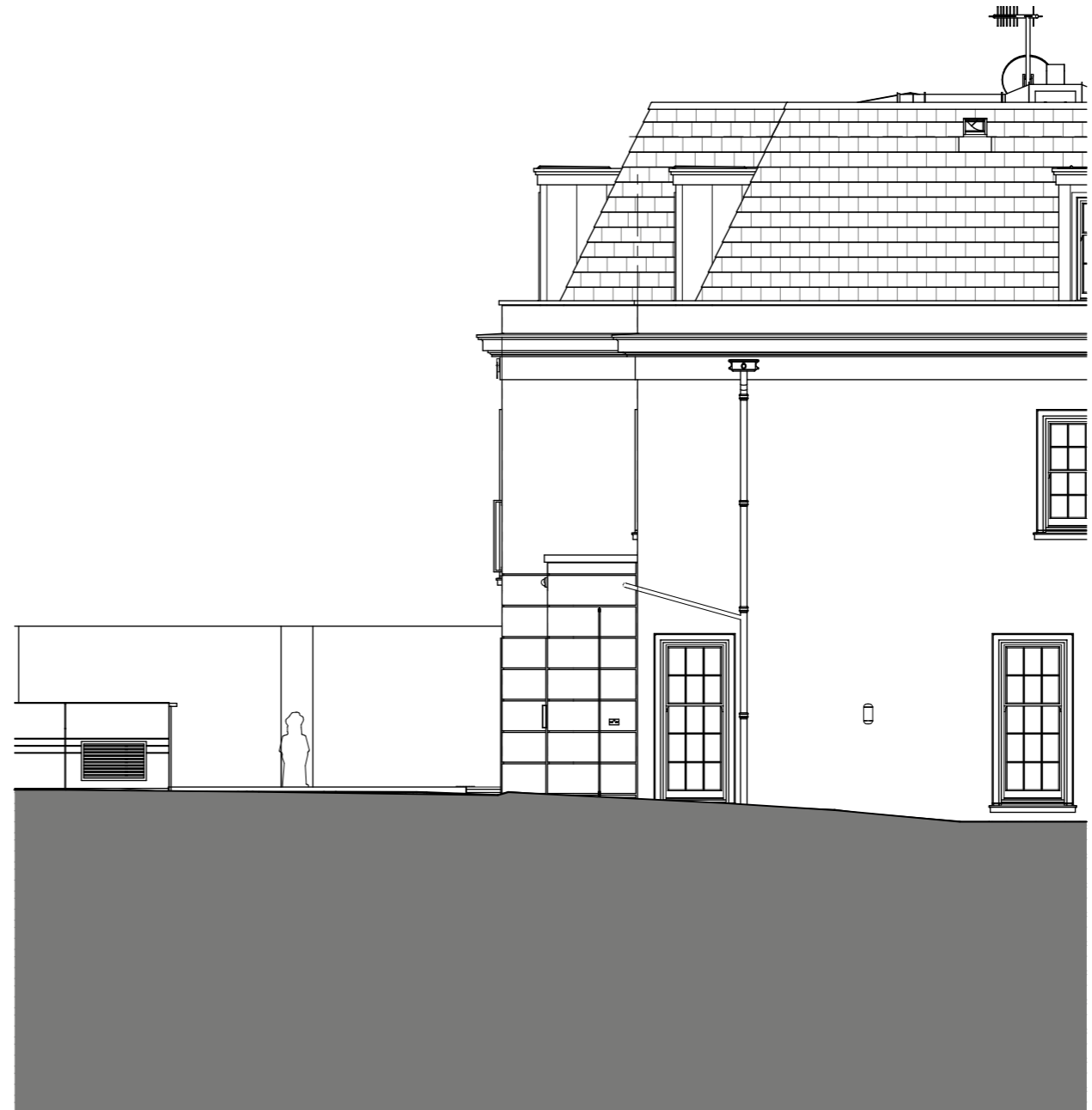
Part NW Elevation 1:100

Notes Simon Merryon Architects Limited has prepared this document in accordance with the instructions of the Client under the agreed appointment. This document is for the sole and specific use of the Client. Simon Merryon Architects shall not be responsible for any use of its contents for any purpose other than that for which it was prepared and provided. This drawing must not be used on site unless issued for construction. Do not scale from this drawing. All dimensions to be site checked and verified. Any deviations to be reported and confirmed. If in doubt ask. No encroachment is permitted over adjoining neighbours' boundary without prior written agreement between both parties. True line of boundary and ownership to be established on site. Neighbouring properties have not been surveyed. Should the Client pass copies of this document to other parties, this should be for co-ordination purposes only. In this case no professional liability or warranty shall be extended to the other parties without the explicit written agreement of Simon Merryon Architects Limited.