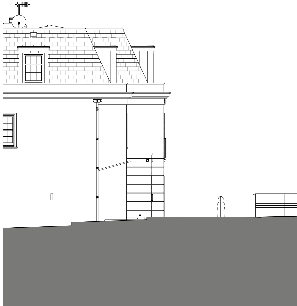
Part SE Elevation 1:100