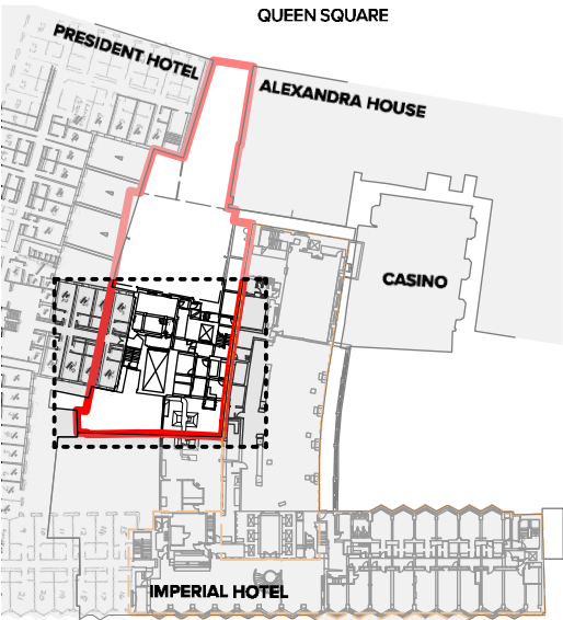
RUSSELL SQUARE LOCATION PLAN - 1:1250 @ A3

Sources: Survey supplied by Maltby Surveys. Original data received April 2018, with updates October 2018 and March 2019. President floorplan sketch received from Imperial Hotel as a scan, December 2018 - CADed as indicative by cube_design ltd.