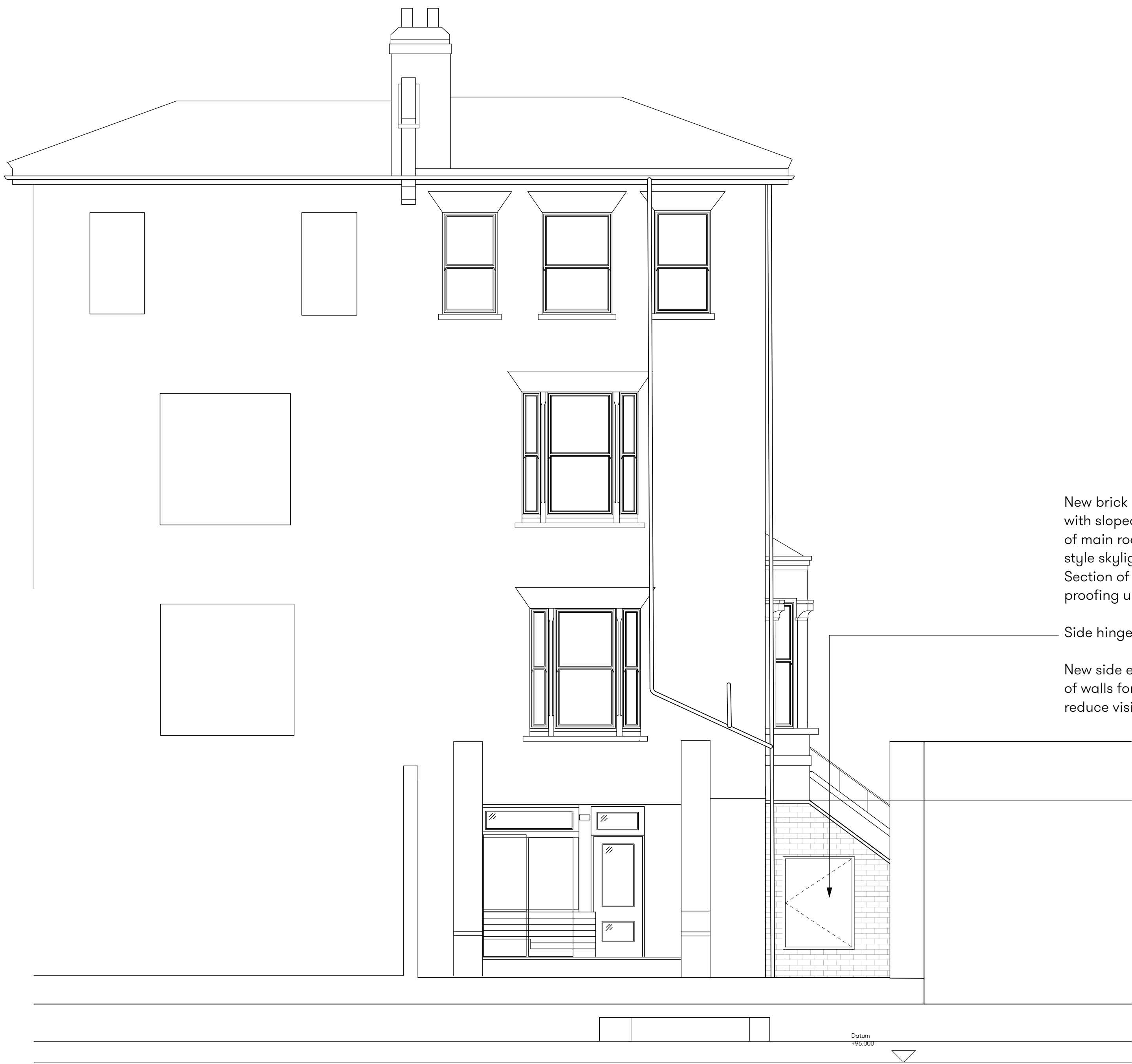
1 Proposed West Elevation Scale: 1:100

New brick (to match existing) side extension with sloped slate roof to match exiting tiles of main roof, with opening conservation style skylight to replace bay window. Section of flat lead roof to provide water proofing upstand