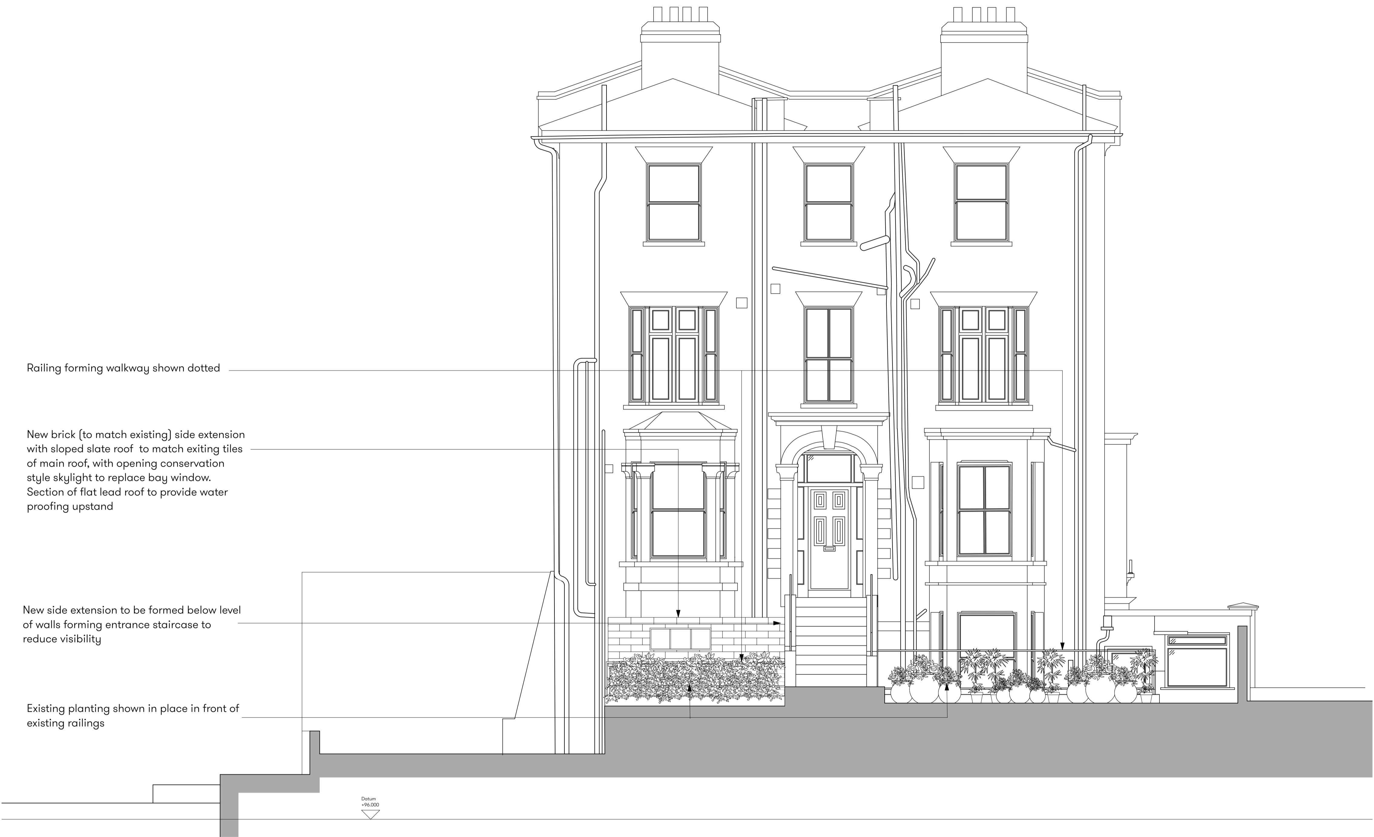
1 Proposed South Elevation Scale: 1:100