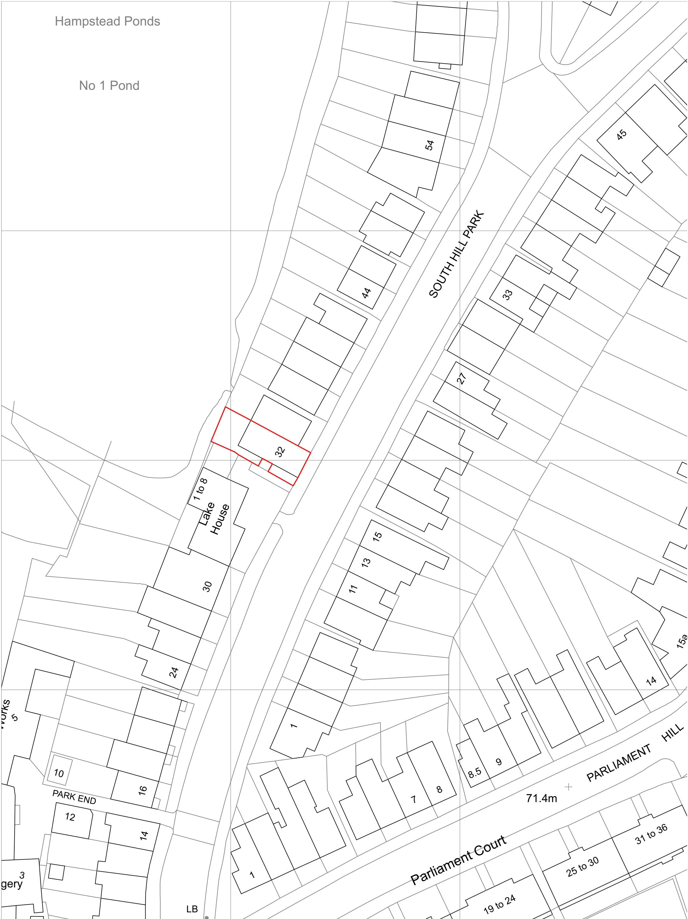
2 Existing Block Plan Scale: 1:500