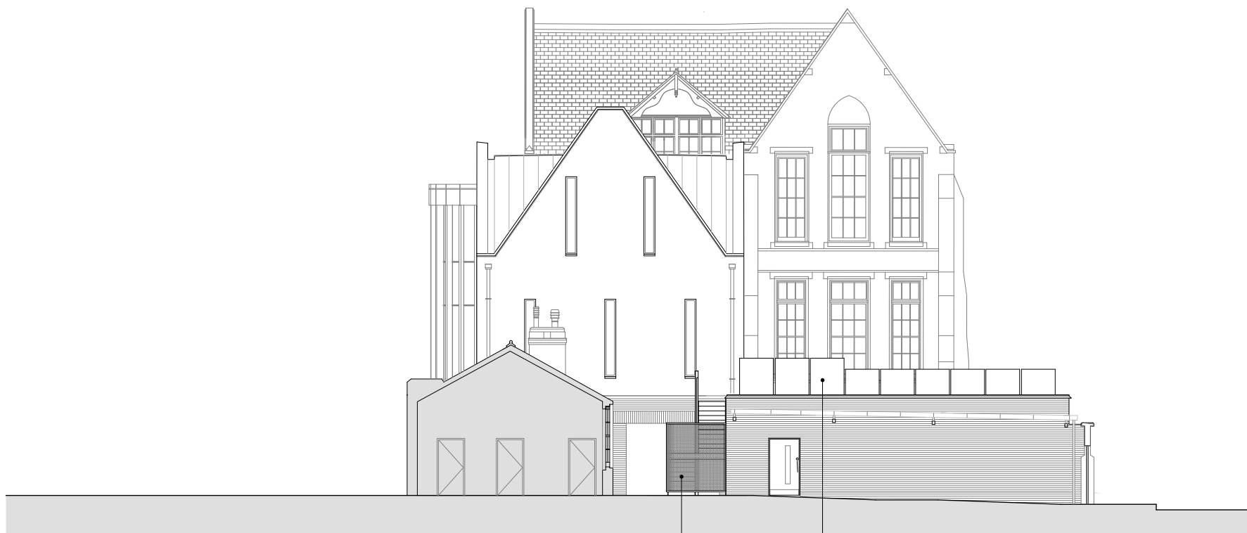
PROPOSED ELEVATION C-C

Proposed structural glass balustrade, comprising 20mm laminated glass with translucent interlayer, 1.5m high (adjacent to neighbouring property) and 1.1m above roof terrace finish level elsewhere