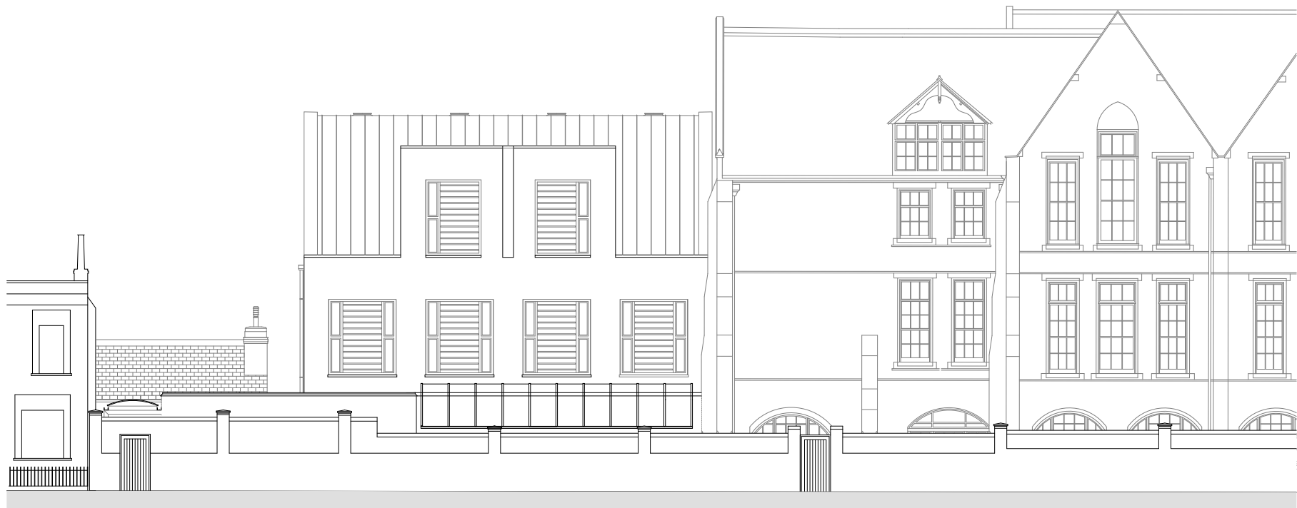
EXISTING CATHCART ST ELEVATION