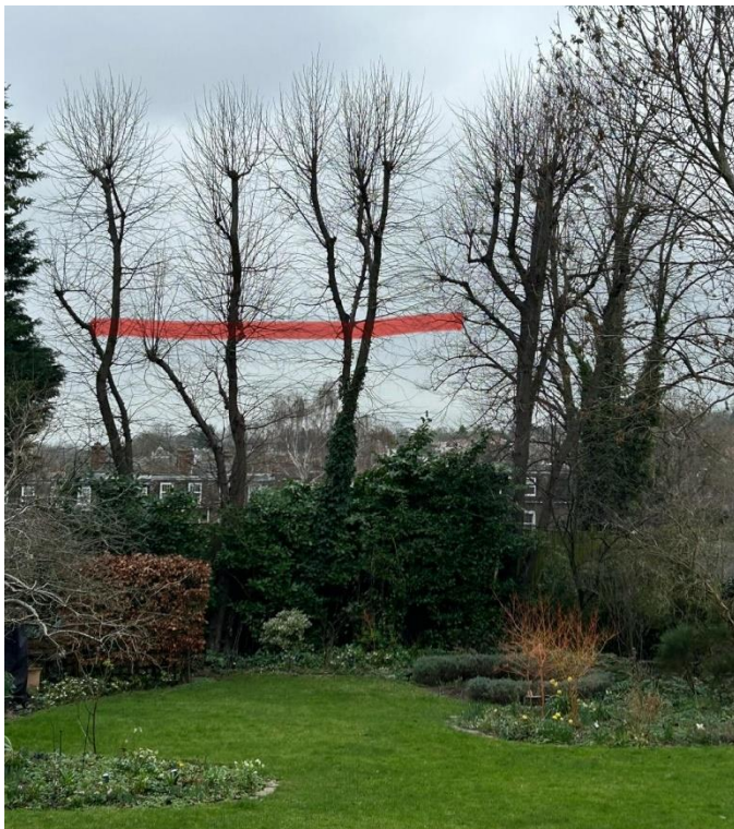
G7: Lime x 4