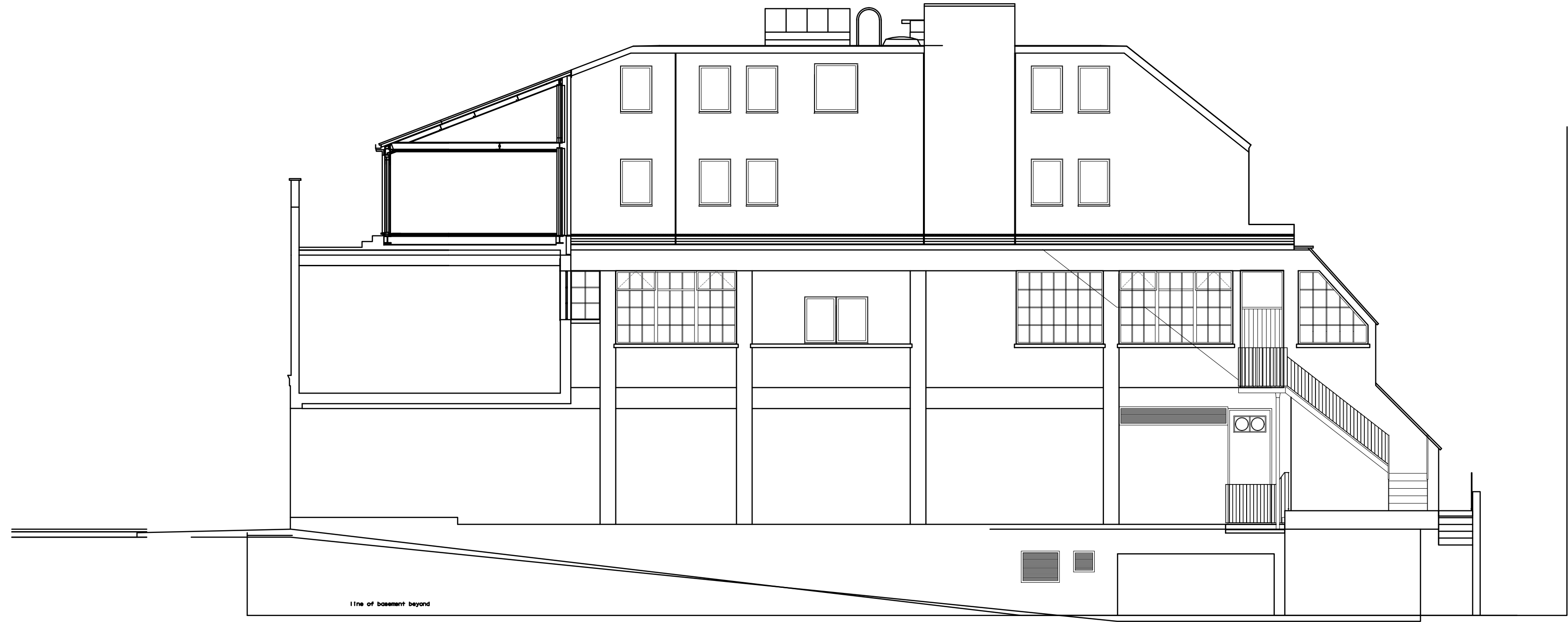
Existing South East Elevation C 1:100