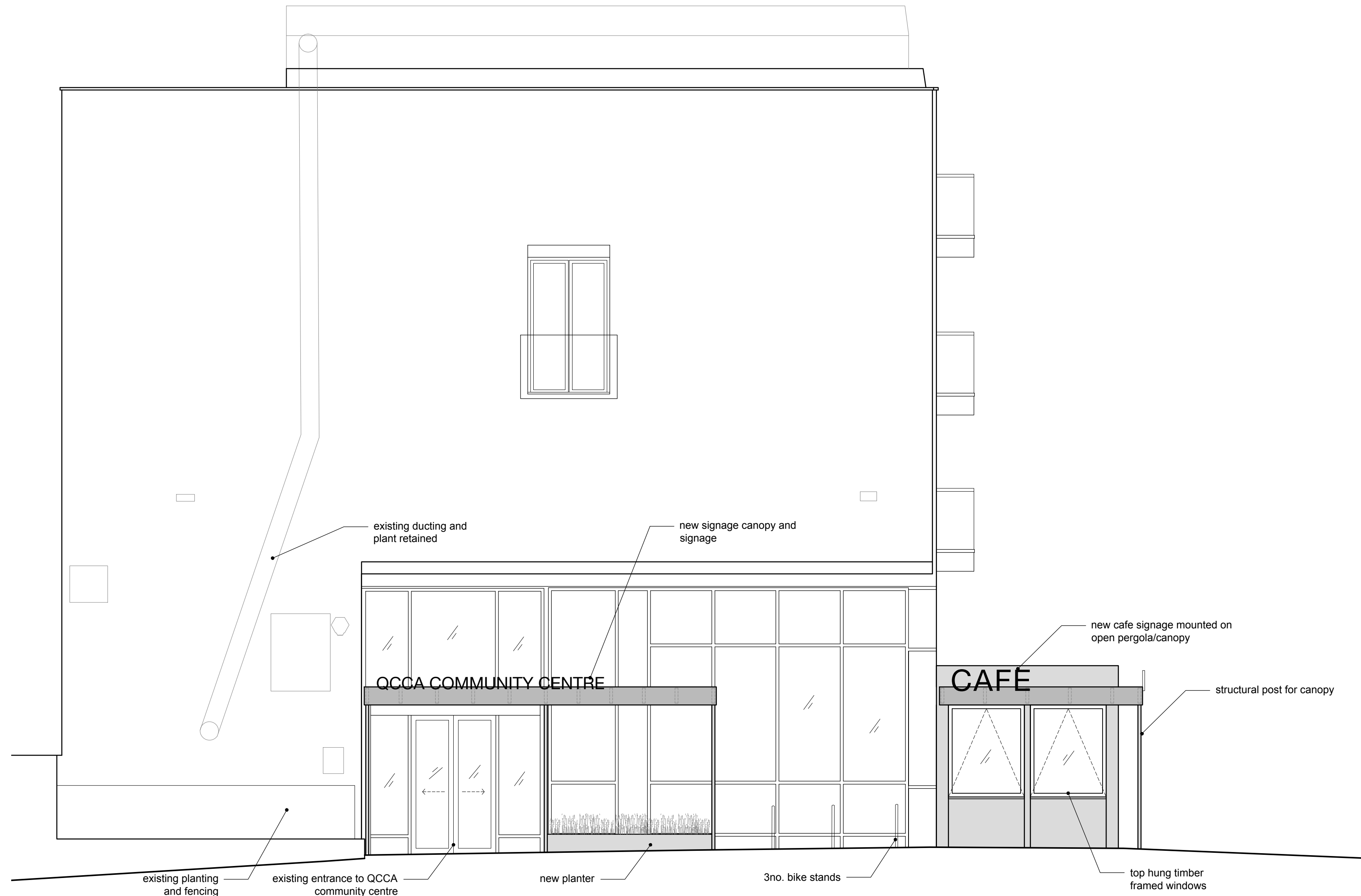
2 200 Proposed Side Elevation 1:50