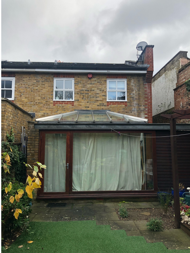
4. Rear elevation of 15 Harwood Street, showing extension