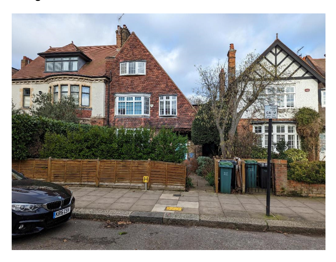
General view from St Albans Road