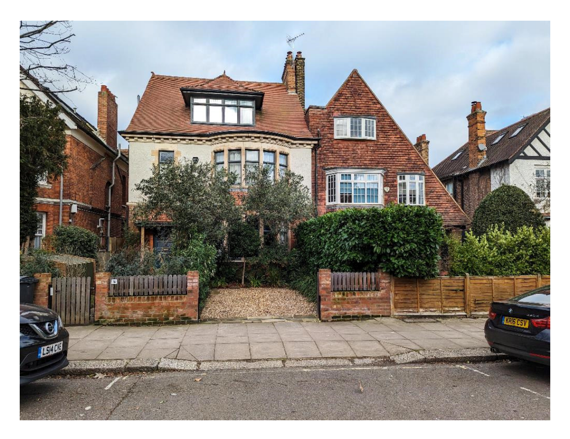
Low wall and picket fence to 16 St Albans Road