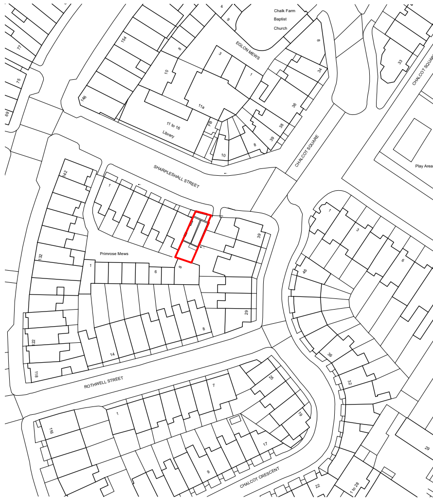
1 Location Plan 1:1250