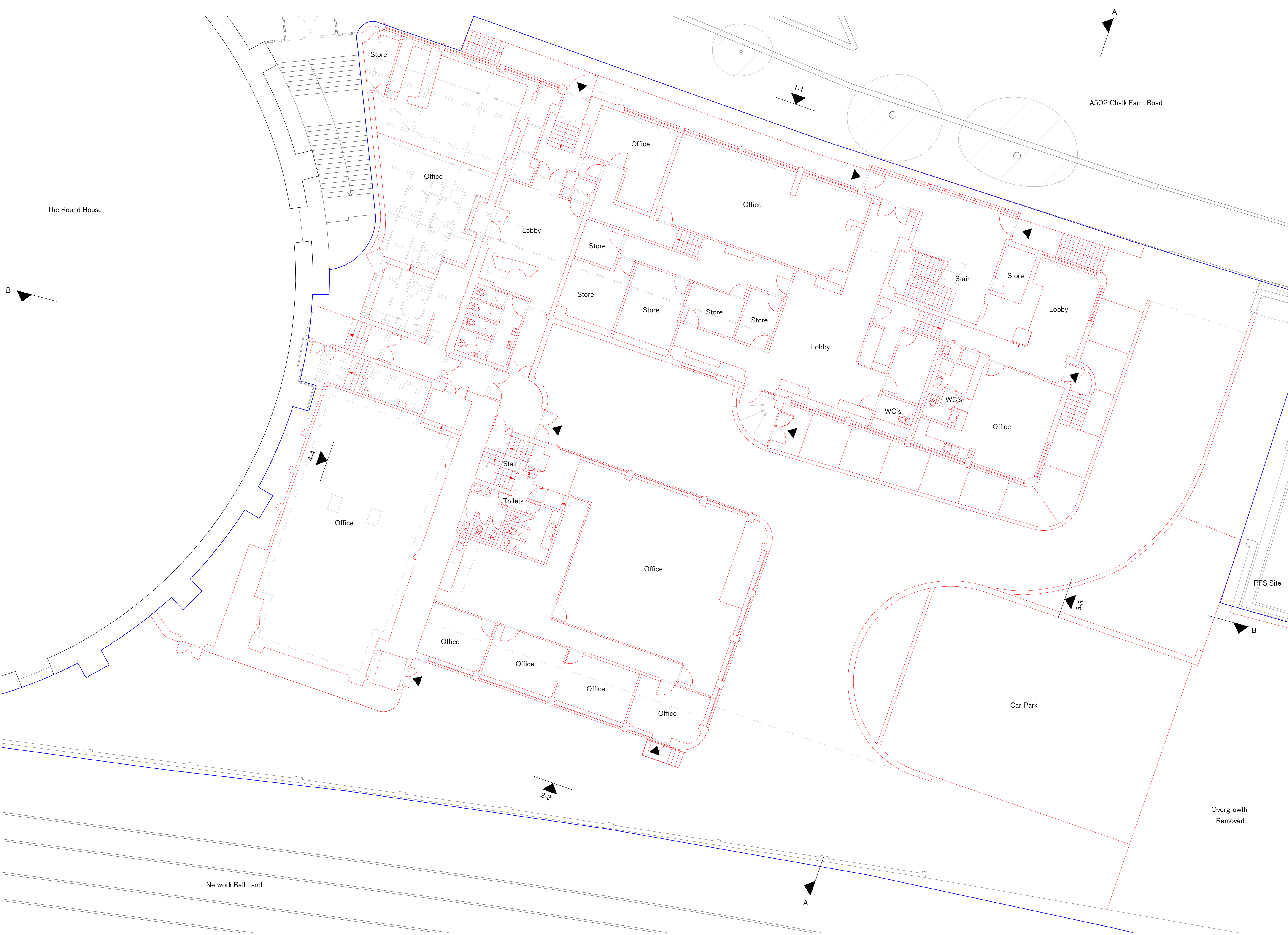
Demolition - Existing Ground Floor Plan